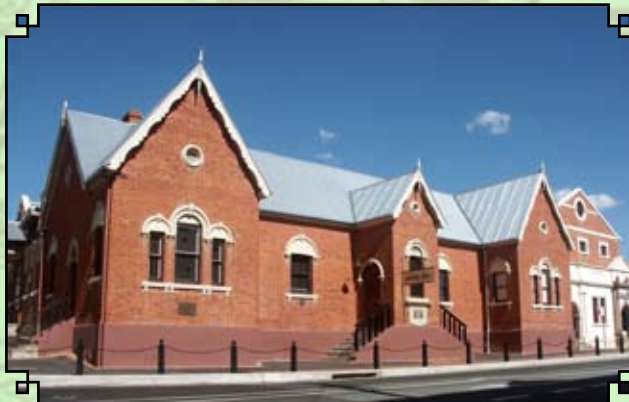
Sir Henry Parkes School of Arts Museum, Tenterfield

The conference and roundtable will be held in the Sir Henry Parkes School of Arts Museum, Tenterfield NSW. Built in the 1870s, this is the very building in which, on 24 October 1889, Parkes made the speech launching his successful campaign to bring together Australia's colonial leaders to forge a national federation. While historians differ on the significance of Parkes' role in federation overall, his 1889 Tenterfield Oration stands as a seminal moment in the long process of Australian nation building. The conference includes sessions and celebrations in the restored banquet room in which Parkes first spoke of the 'great commonwealth' to come.