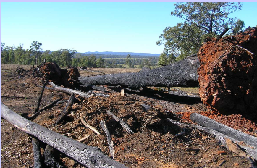
A 200 metre long windrow containing charred remains of some reasonably large trees, the one pictured measuring at least 800mm DBH, and double the size of anything that had been left in the paddock.

Most areas of 'predominately non forest' on the north coast were previously cleared for grazing purposes, but retained varying numbers of 'paddock trees' or 'cattle camps' (groves of trees left to provide shade for stock). The Code of Practice recognises the importance of these remnant trees in terms of habitat and refuge for wildlife, and stipulates a minimum number of habitat trees that must be left standing.