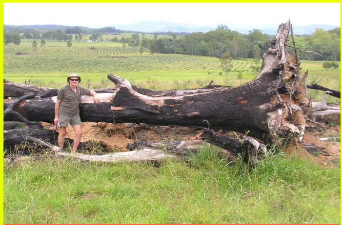
Typical plantation cleared of habitat trees, such as those in the foreground

Likewise the potential for cross-pollination is never assessed.