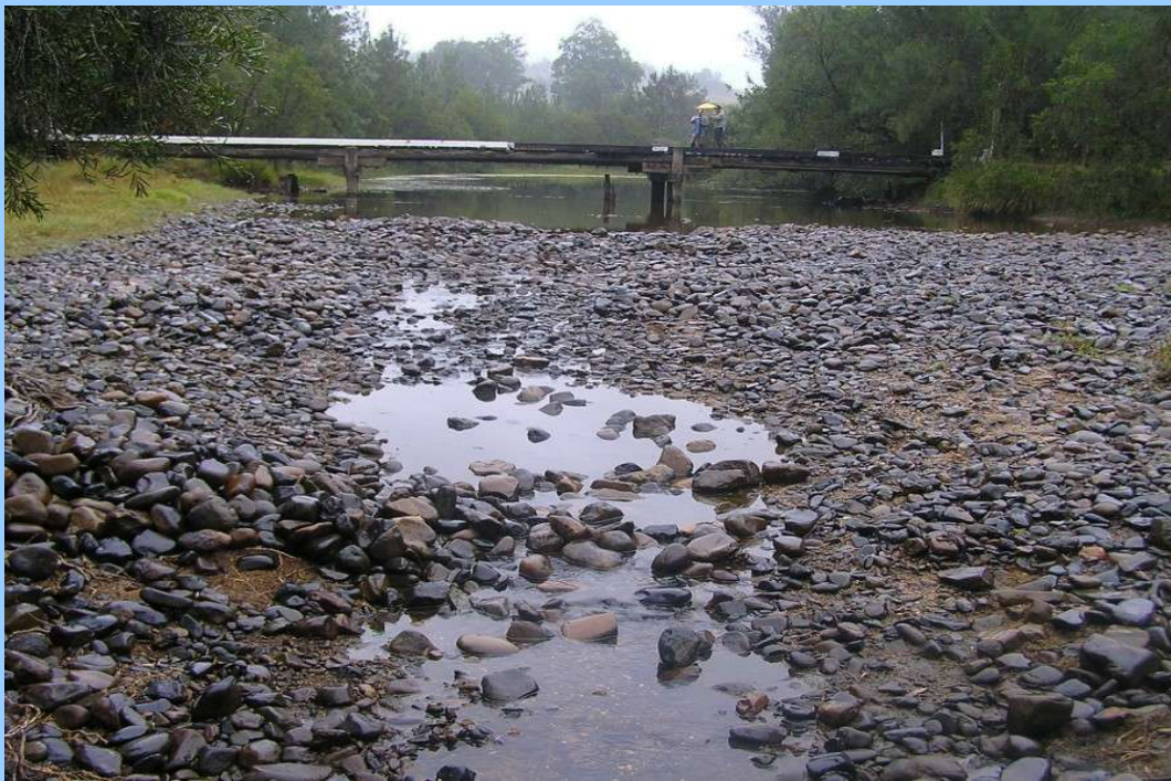
A clearly stressed Clarence River in northern NSW, reduced to a trickle in 2007, not even a drought year. This catchment has seen unprecedented plantation development in the past decade, a clear concern for environmentalists and an ever increasing number of farmers.

The plantation forest industry's assertion that it only expects to expand the plantation estate in the Murray Darling by 50,000 hectares over the next 15 years, seems highly conservative, given the same industry has probably planted more than that in the Clarence Valley in just five years. The disturbing prediction of a further 1% reduction of flow in the already stressed Murray Darling Basin as a result of that predicted expansion, is then answered by claims that: “Guidelines can be developed to minimise the impact of reforestation on water supplies. For example, water use is less if plantations are located in elevated parts of catchments or in lower rainfall zones, or if distributed in smaller blocks across a catchment. Water use is also reduced for several years after a plantation is thinned.”