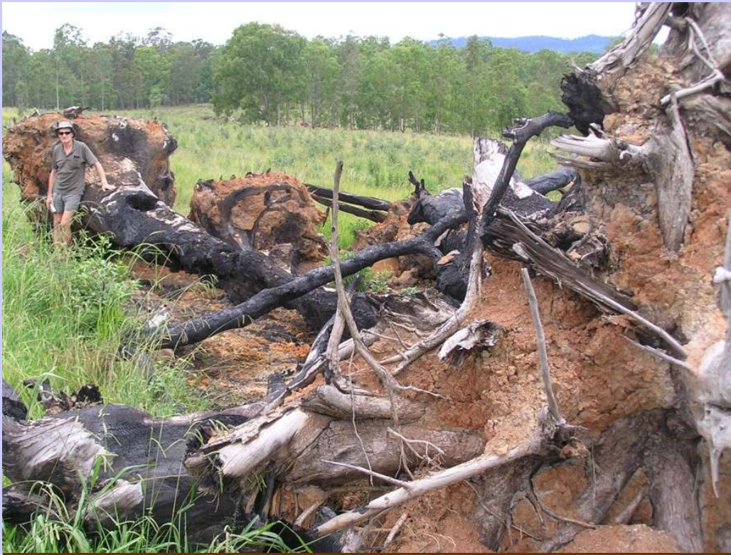
Virtually all habitat trees at this Coaldale plantation in the Clarence Valley were 'legally' bulldozed, courtesy of badly worded, ill-conceived legislation.