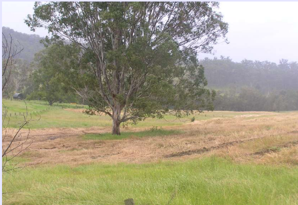
Land sprayed with a cocktail of herbicides for quick knock-down of all vegetation.

For Eucalypt plantations herbicide mixtures are applied prior to planting. Chemical fertilizers are applied at planting, and further herbicide is used to address weeds within the first 2 years. After this various insecticides and fungicides are required to combat problems attracted to these monocultures.