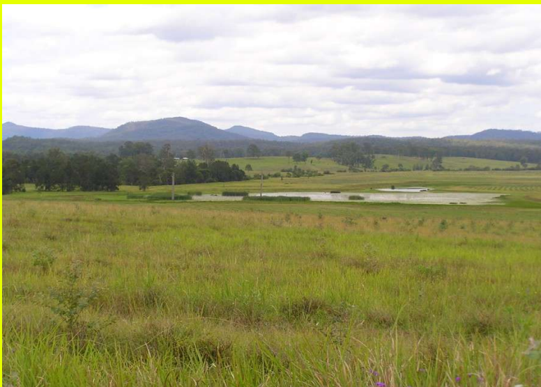
A typical wetland, surrounded by plantation. As the trees grow, larger water birds will be unable to exit the site.

It appears the plantation developers 'mound' up the tree rows along the contours ostensibly to prevent erosion. However it seems likely this is being done in order to intercept as much water as possible from entering creek lines.