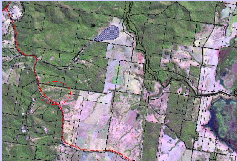
A plantation near Lawrence in the Clarence Valley. The red circled area showing the relatively heavily wooded area before plantation clearing took place.

An example of this is depicted in the aerial image at right, where the red circled area clearly shows a relatively high forest density, subsequently bulldozed and burned (see photograph below).