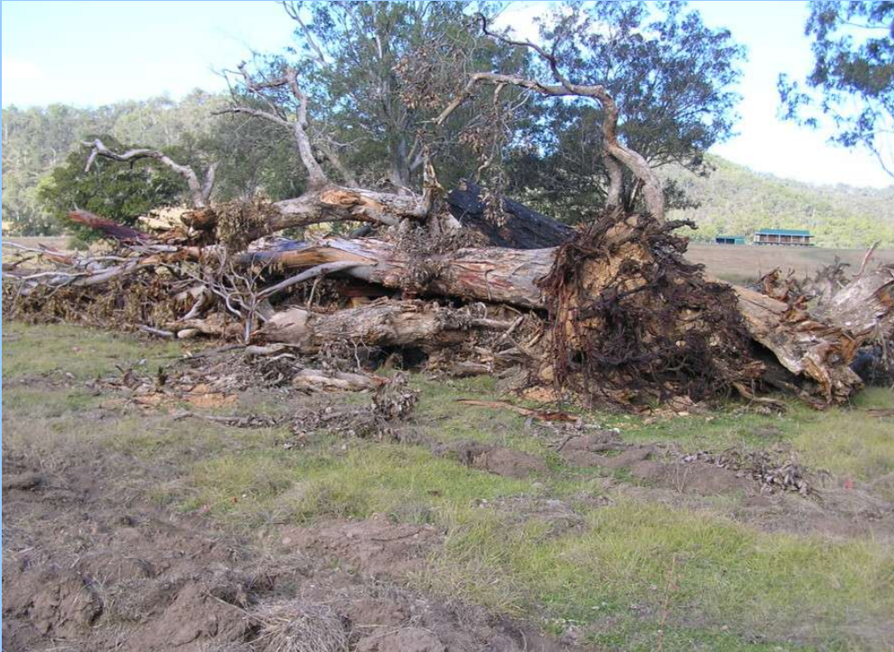
A common sight in the Clarence Valley, old-growth Red Gums bulldozed to plant Dunns White Gum seedlings, a species only any good for wood-chip.