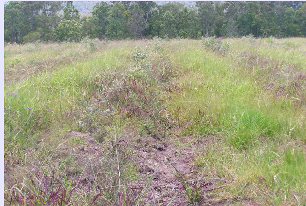
Rows of weed infested saplings sprayed with selective herbicide

Despite all the above, there is no mention of any negative environmental or social aspects of chemical use in the report, and the only conclusion made is: “The use of pesticides in plantation forestry is limited, restricted to particular stages of crop development and actively regulated.”