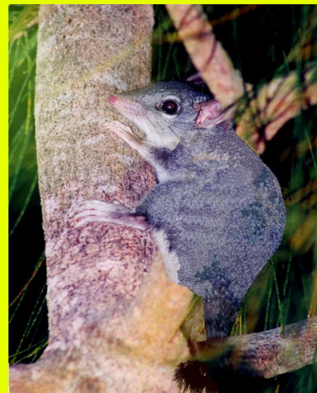
Threatened Brush-tailed Phascogale

Even the small concession made in the Code to retain one habitat tree per hectare is wiped out by an exemption allowing any habitat tree to be removed as long as 10 or 20 trees (depending on its size) are planted, or allowed to regenerate in its stead. The fact that it will possibly take 200 years before the new trees effectively replace those old trees, to the point they will provide the same level of habitat, is seemingly ignored or considered immaterial.