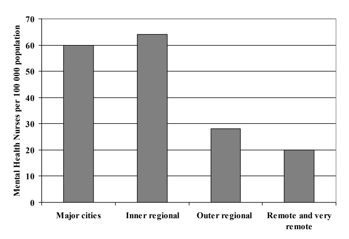
Figure 5.2 Number of mental health nurses per 100 000 population

6.23 Submissions referred to the difficulty in recruiting and retaining nurses in the field of mental health. The ageing of this workforce was noted as a significant problem, with mental health nurse Mr Jon Chesterson observing that: