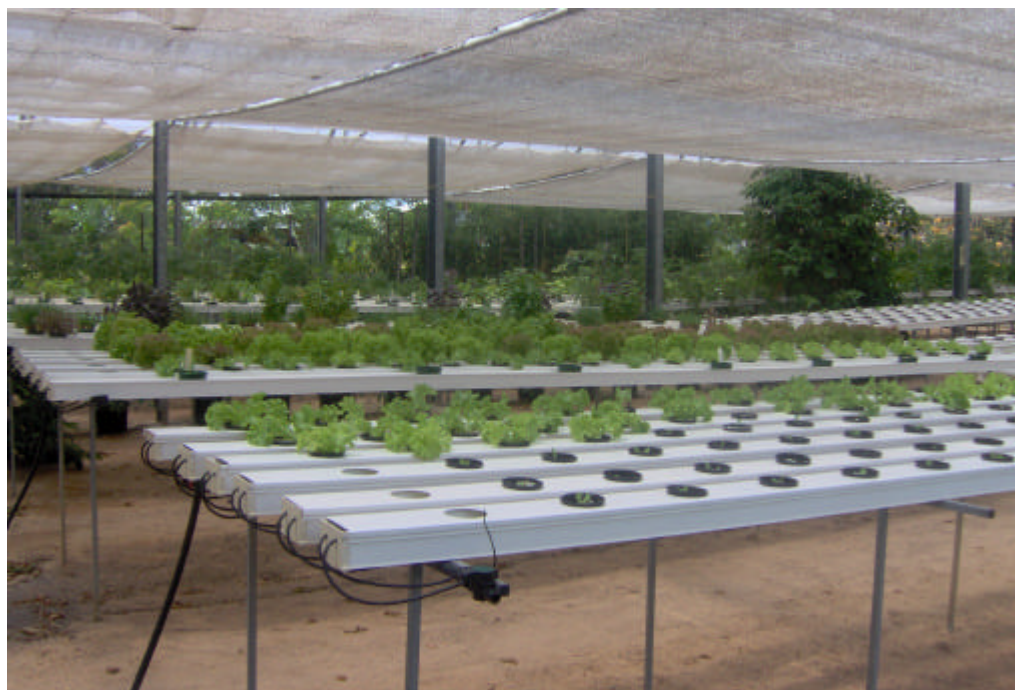
Figure 5.1 Hydroponics greenhouse in the Badu plant nursery

fresh vegetables into the local diets, 'teaching people to have fruit and vegetables every day' . The take-away store had both fast and healthy foods, utilising fresh salads from the hydroponics garden.