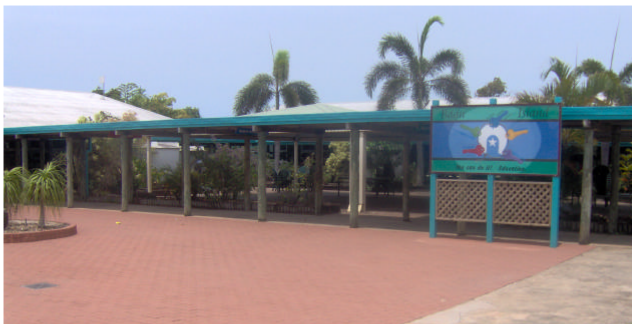
Figure 5.2 Badu Island State School