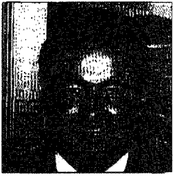
Mayor Brenton Pavier