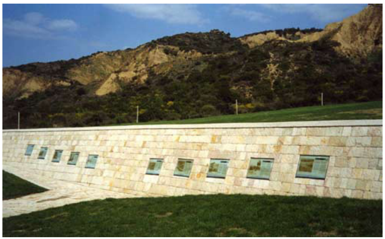
Plate (i)—ANZAC Commemorative site - information panels, Turkey