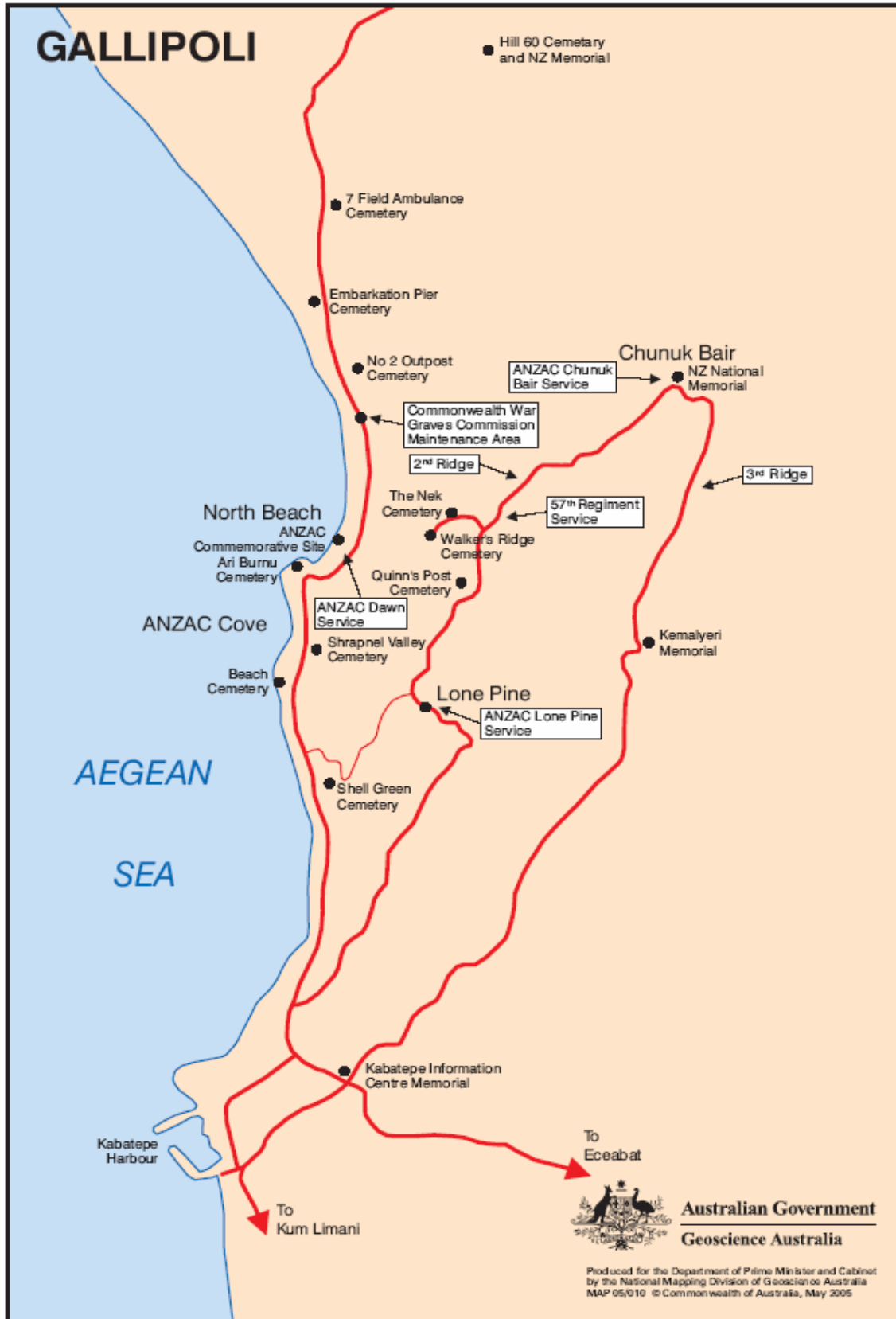
Plate (1) 1.8 Map of the Gallipoli Peninsula