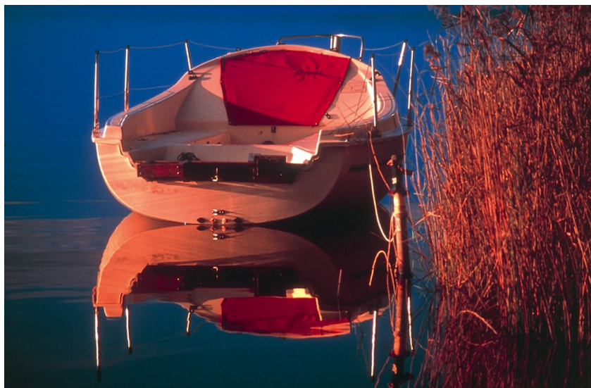
River Boat on Noosa River at Sunrise