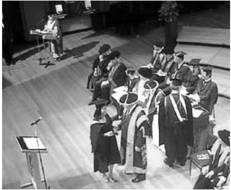
Graduation at Southern Cross University. At most universities the student organisations provide for the hire of academic dress for graduation.

Shower, Change and Locker Facilities Leisure Activities Student Development Courses Concerts International Student Services and Advice Student Employment Service International Clubs Childcare Travel Service Trips and Tours Discount Ticketing Function Spaces Dental Services Welfare Services Representation on University Bodies On Campus shops Social Activities Photocopy Service Campus Sports Gymnasiums Facility Upkeep and Maintenance Interest Clubs and Societies Art Galleries Information and Enquiry Service Bookshops and Retail Outlets University Diary Campus Media/Student Newspapers Sporting Clubs and Societies Bars and Bistros Conference and Meeting Rooms Academic Dress University Games Academic Advice and Advocacy