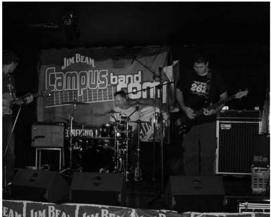
The National Campus Band Competition organised by student organisation activities officers around the country hits Darwin.

Services Provided (16 of the AVCC's 45 service categories) Catering and Food Service Computer Facilities Shower, Change and Locker Facilities Leisure Activities Welfare Services Representation on University Bodies On Campus shops Social Activities Photocopy Service Gymnasiums Cinemas and Theatres University Diary Campus Media/Student Newspapers Sporting Clubs and Societies University Games Academic Advice and Advocacy