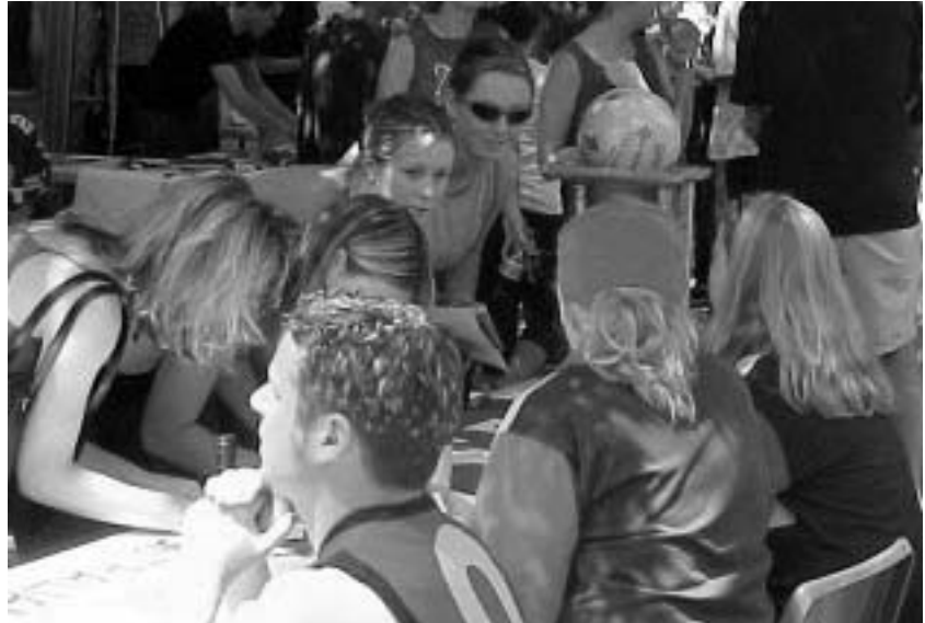
Orientation Week at U Can. Over 50 sporting, religious, cultural, faculty, social and political clubs vie for members

Campus Radio or TV Childcare Discount Ticketing Function Spaces Dental Services Welfare Services Representation on University Bodies On Campus shops Social Activities Photocopy Service Campus Sports Gymnasiums Cinemas and Theatres Facility Upkeep and Maintenance Interest Clubs and Societies Information and Enquiry Service University Diary Campus Media/Student Newspapers Legal Services Sporting Clubs and Societies Bars and Bistros Academic Dress University games Academic Advice and Advocacy