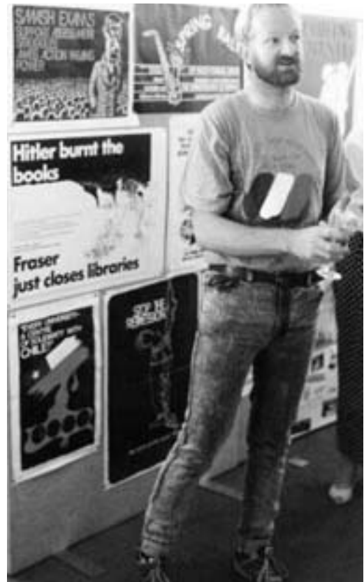
The Students' Association of Flinders University runs Australia's last student-run commercial printing press. Many classic and notorious political and music posters and album covers have been printed here since the late 1960s.