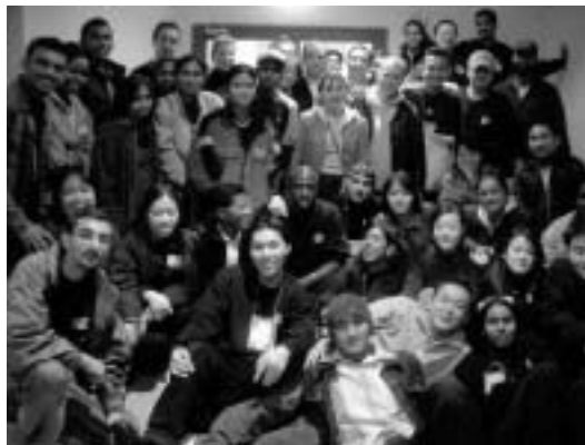
ECU International Student Induction Session

The Edith Cowan University Postgraduate Association hosts the annual postgraduate student awards for staff excellence each year in order to give students the opportunity to nominate staff for excellence, and also to ensure that good staff receive recognition for their outstanding performance. Students can nominate staff for one or more of the following categories: