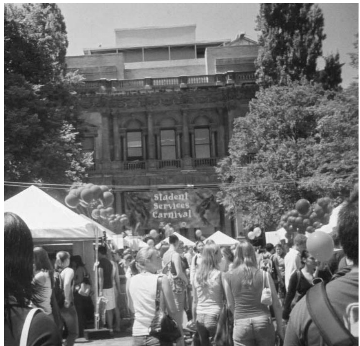
2005 O-Week Student Services Carnival. Melbourne University student organisations are up and running after the problems of last year.

Student Accommodation Binding Services Catering and Food Service Student Theatre Sporting Facilities Student Lounges Computer Facilities Shower, Change and Locker Facilities Leisure Activities Student Development Courses Concerts International Student Services and Advice Student Employment Service International Clubs Campus Radio or TV