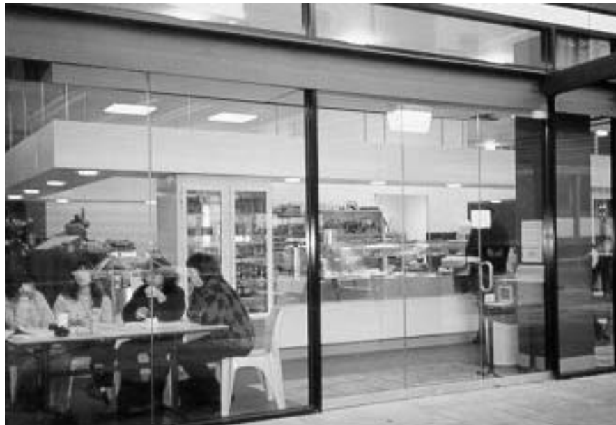
Student Union caf at Swinburne

Catering and Food Service Employment Service Sporting Facilities Student Lounges Leisure Activities Welfare Services Representation on University Bodies On Campus shops Social Activities Campus Sports Cinemas and Theatres Interest Clubs and Societies Information and Enquiry Service Bookshops and Retail Outlets University Diary University Games Legal Service Academic Advice and Advocacy Other