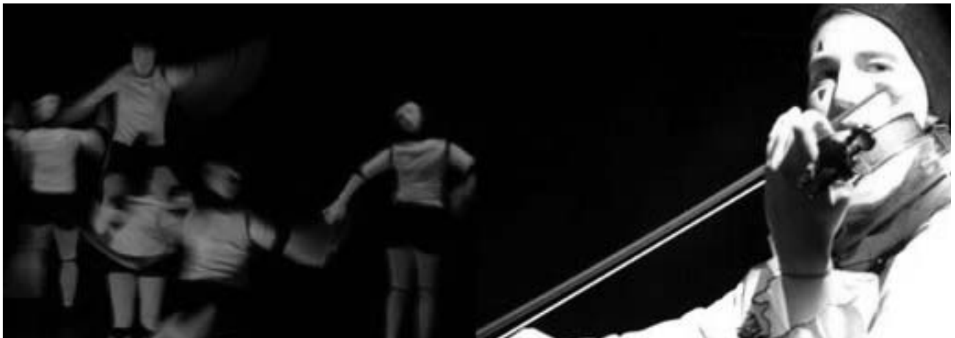
From Melbourne University Drama Festival 2004