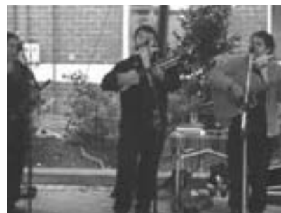
Swinburne Multi-Cultural Week

Membership Opt-Out Provisions: Not requirement of enrolment