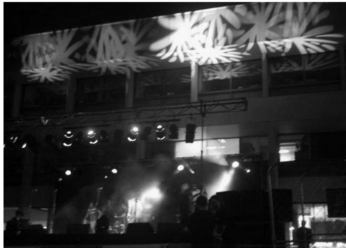
2004 O-Week Concert at Griffith University Nathan campus

Officers from the Centrelink Student Services Unit have been based on campus at the Gold Coast Student Guild office for the last few years. They access a direct on-site linkup to Centrelink database, enabling records to be adjusted, forms submitted and general queries answered. In between times the Education and Student Support staff can organise a phone link-up on special direct numbers to Centrelink who will answer queries and give advice. Documents can be faxed to Centrelink from the Student Guild free of charge.