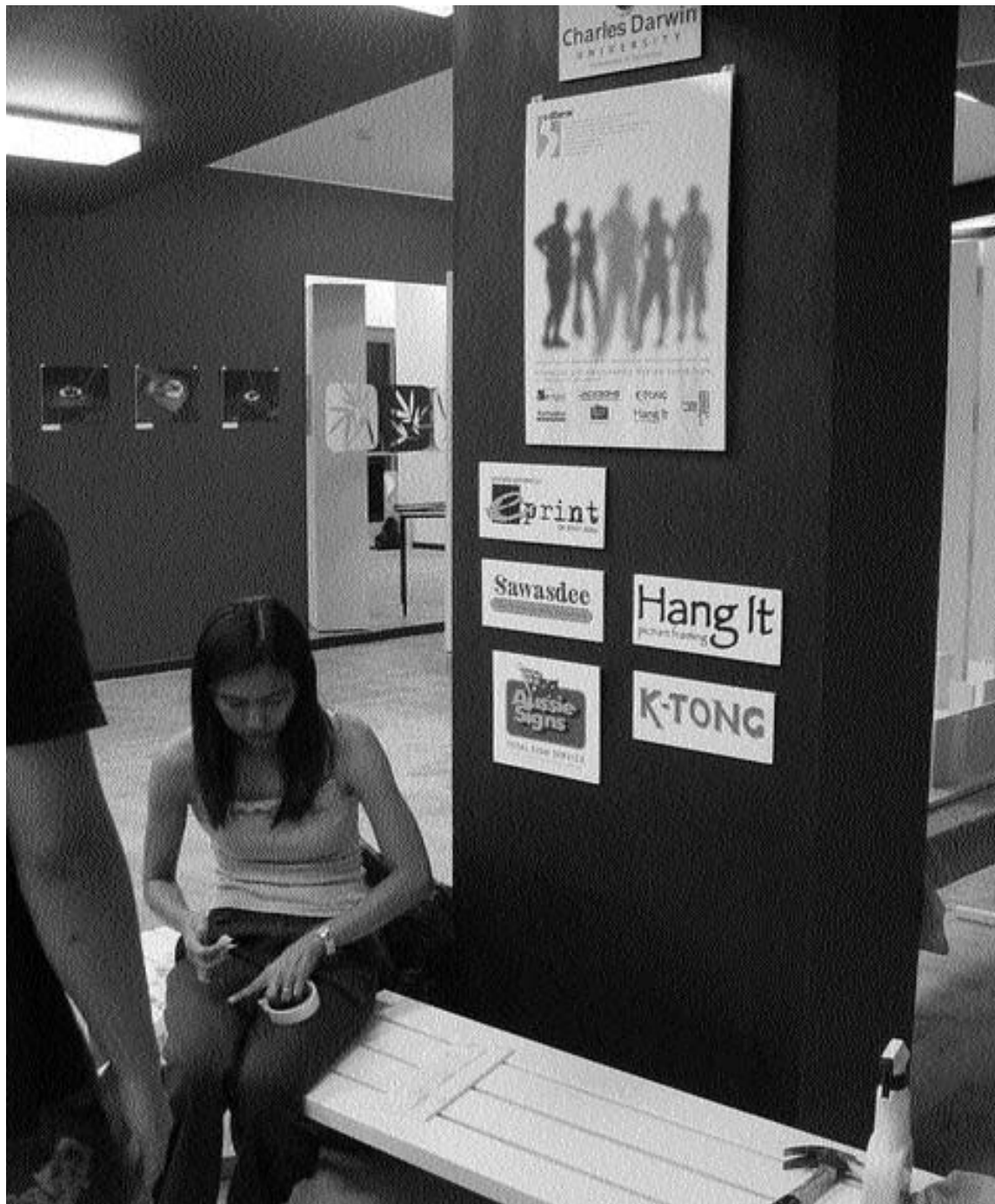
Graphic design students exhibit their work at The Charles Darwin University Students' Union Art Gallery

Function Spaces Welfare Services Representation on University Bodies On Campus shops Social Activities Photocopy Service Campus Sports Interest Clubs and Societies Information and Enquiry Service Bookshops and Retail Outlets Campus Media/Student Newspapers Legal Services