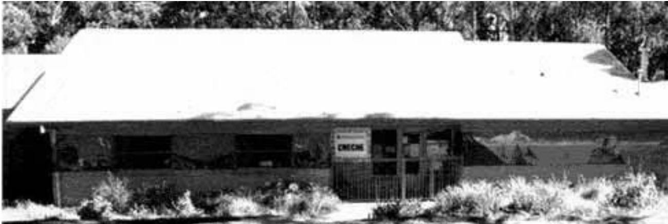
The University of Ballarat Students' Associations runs professional daytime childcare facilities for children aged 0-6 at the Mt.Helens campus

Bookshops and Retail Outlets Campus Media/Student Newspapers Legal Service Sporting Clubs and Societies Bars and Bistros Conference and Meeting Rooms Academic Dress