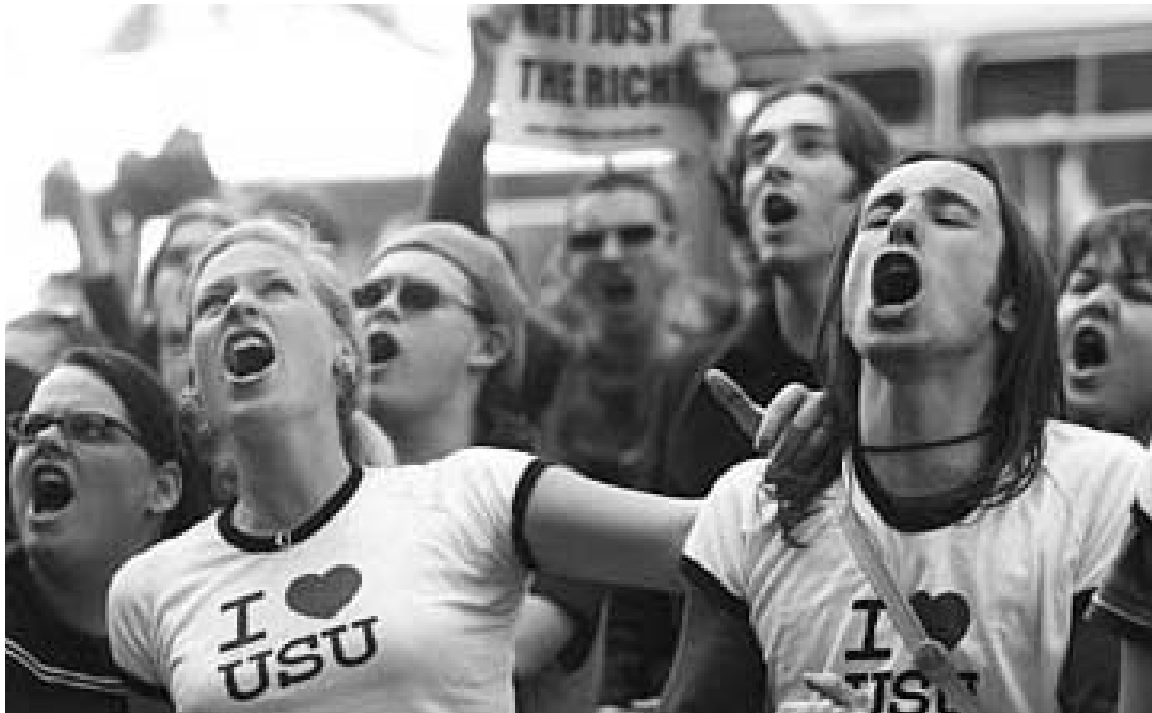
NSW students campaigning in favour of universal student unionism