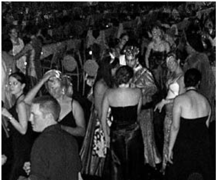
O-Week Ball put on by the Southern Cross Uni Students' Association

Student Accommodation Binding Services Catering and Food Service Sporting Facilities Student Lounges