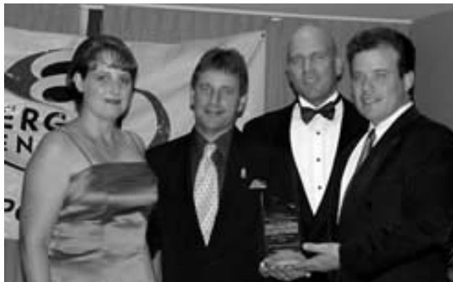
In 2003 the CQU Students' Association won the Rockhampton Regional Development & Ergon Energy Business Excellence Awards. In 2002 it won the Rockhampton Chamber of Commerce Award for a 'Not for Profit Organisation'

Catering and Food Service Student Lounges Leisure Activities Concerts International Student Services and Advice Student Employment Service International Clubs Trips and Tours Discount Ticketing