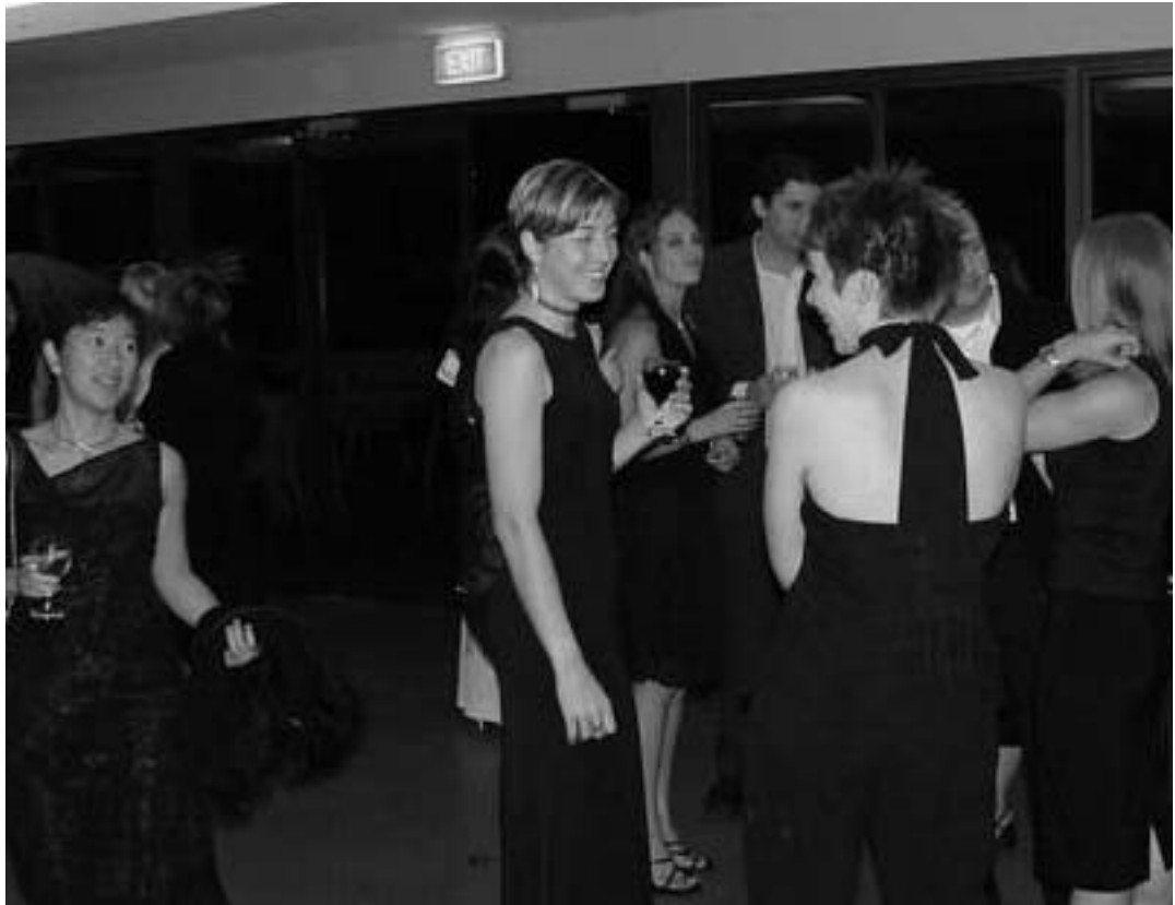
Even hard-working postgraduates have got to have some fun some times - Wollongong University Postgraduate Association puts on the postgraduate ball.