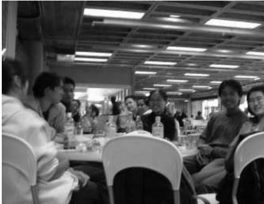
Student Refectory at Macquarie University

Childcare Welfare Services On Campus shops Social Activities Photocopy Service Campus Sports Gymnasiums Cinemas and Theatres Facility Upkeep and Maintenance Recreational Libraries Interest Clubs and Societies Information and Enquiry Service Campus Media/Student Newspapers Legal Services Sporting Clubs and Societies Bars and Bistros Conference and Meeting Rooms Academic Advice and Advocacy