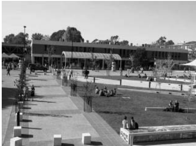
The living heart of the campus - ANU Union Building and Courtyard

Binding Services Catering and Food Service Student Theatre Sporting Facilities Student Lounges Shower, Change and Locker Facilities Leisure Activities Concerts Student Employment Service International Clubs Travel Service Discount Ticketing Function Spaces Dental Services Welfare Services On Campus shops Social Activities Photocopy Service Campus Sports Gymnasiums Facility Upkeep and Maintenance Recreational Libraries Computer Facilities Interest Clubs and Societies Art Galleries Information and Enquiry Service