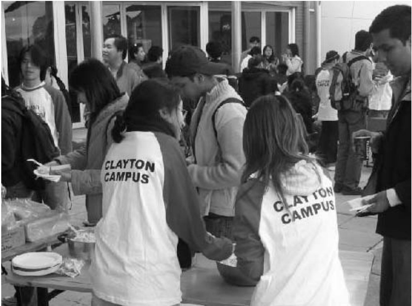
Monash University International Students Service Orientation BBQ for newly arrived students. International student organisations provide a wide variety of the support, social and advocacy for the 150,000 international student studying in Australia.

Childcare Travel Service Trips and Tours Discount Ticketing Function Spaces Welfare Services Representation on University Bodies On Campus Shops Dental Service Art Galley Social Activities Photocopy Service Campus Sports Gymnasiums Cinemas and Theatres Facility Upkeep and Maintenance Recreational Libraries Interest Clubs and Societies Information and Enquiry Service Bookshops and Retail Outlets