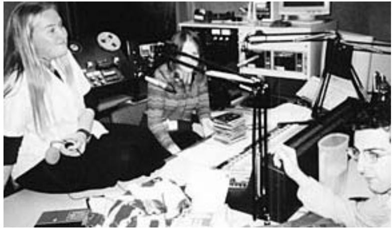
Students from South Australia's three universities collaborate to put together the evening Student Radio component for Radio 5UV.

Binding Services Catering and Food Service Sporting Facilities Student Lounges Computer Facilities Shower, Change and Locker Facilities Leisure Activities Student Development Courses Concerts International Student Services and Advice Student Employment Service International Clubs Campus Radio or TV Childcare Discount Ticketing Function Spaces Dental Services Welfare Services Representation on University Bodies On Campus shops Social Activities Photocopy Service Campus Sports Gymnasiums Facility Upkeep and Maintenance Recreational Libraries Interest Clubs and Societies Information and Enquiry Service Bookshops and Retail Outlets University Diary Campus Media/Student Newspapers Legal Services Sporting Clubs and Societies Bars and Bistros Conference and Meeting Rooms Academic Dress University Games Academic Advice and Advocacy