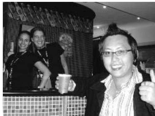
Student Tavern at Murdoch

Membership Opt-Out Provisions: Not requirement of enrolment, can opt out through completion of a form. Student Guild receives proportion of fee equivalent to students who do not opt out