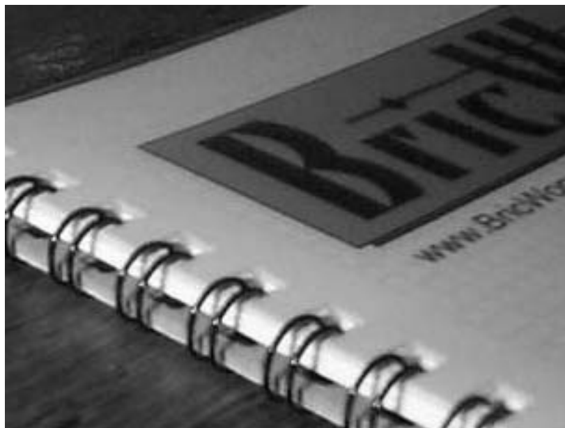
La Trobe SRC runs a very cheap book-binding service for students

Welfare Services Representation on University Bodies On Campus shops Social Activities Photocopy Service Campus Sports Gymnasiums Cinemas and Theatres Facility Upkeep and Maintenance Recreational Libraries Interest Clubs and Societies Information and Enquiry Service Bookshops and Retail Outlets University Diary Campus Media/Student Newspapers Legal Services Sporting Clubs and Societies Bars and Bistros Conference and Meeting Rooms Academic Dress University games Academic Advice and Advocacy Other