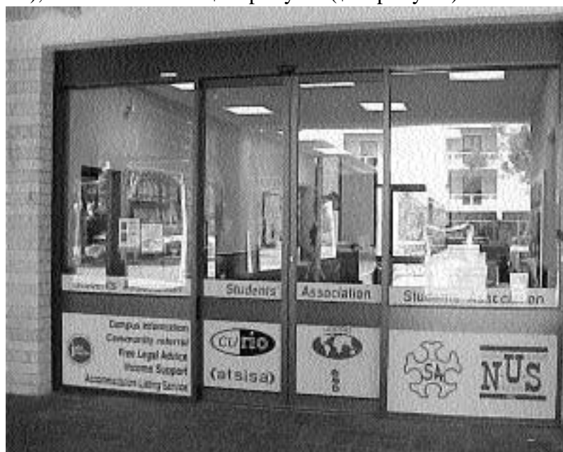
University of Canberra Students' Association provides free academic rights, welfare and legal advice to UC students

Student Employment Service Catering and Food Service Student Theatre Sporting Facilities Student Lounges Shower, Change and Locker Facilities Leisure Activities Student Development Courses Concerts International Student Services and Advice International Clubs