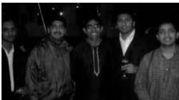
Bringing together students from around the world. Victoria University International Students' Association social event