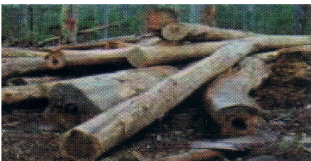
Photo of “wood waste” in a National Association of Forest Industries (NAFI) brochure on wood fired power

The term “wood waste” refers to low grade timber material with no other identifiable market or environmental value. This includes material left that is left in the forest after the higher value