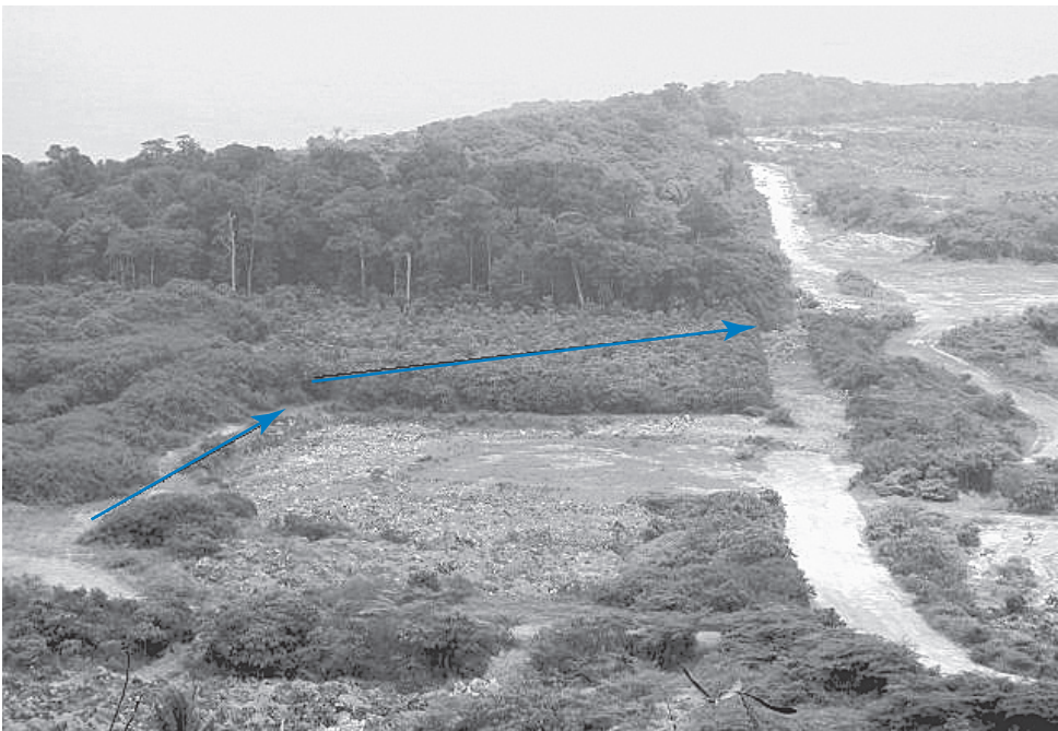
Aerial view of the site. The arrows indicate the bulldozer track. This action has essentially cut the block of rehabilitated land in half. The area of primary forest is immediately behind the site.