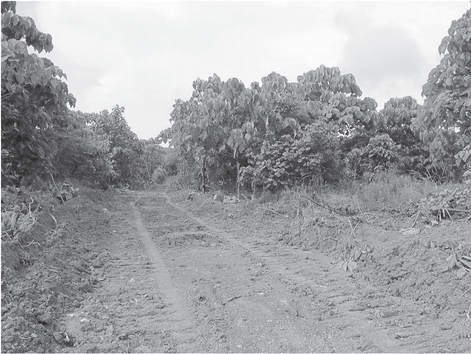
Close up view of bulldozer track through the rehabilitated area on Christmas Island.