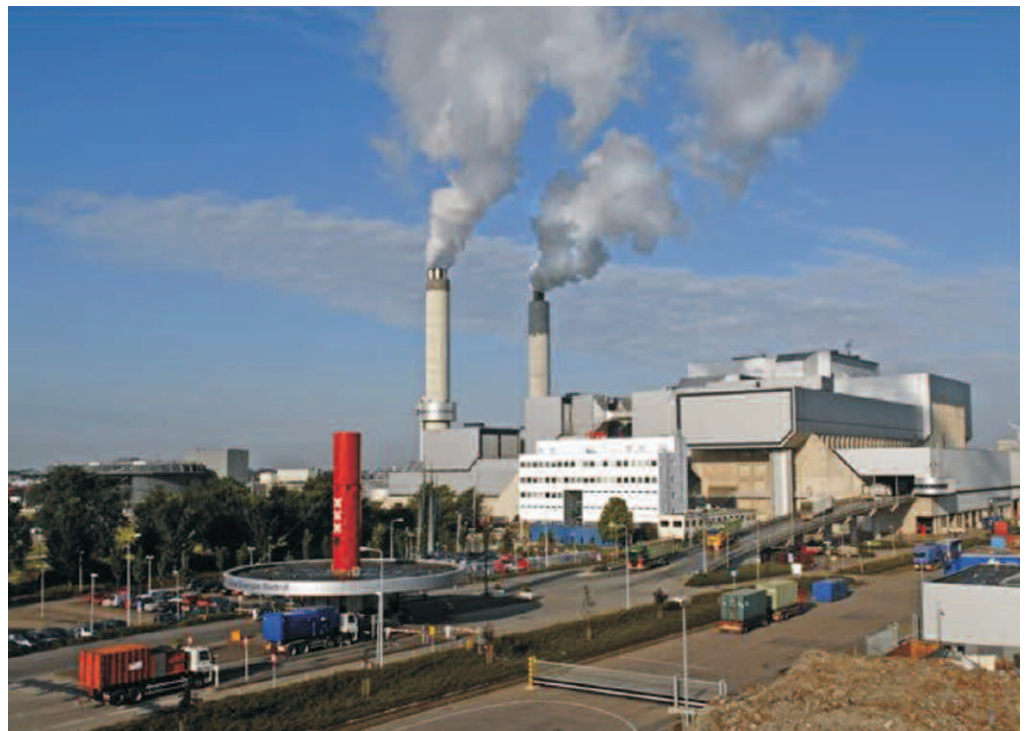
Waste Fired Power Plant® Amsterdam, photo courtesy of AEB.

AEB Amsterdam's Waste Fired Power Plant disposes of all household, industrial and commercial waste produced in the city of Amsterdam and 27 neighbouring municipalities. Approximately 840,000 tonnes of waste per year are used for power generation in the four existing combustion lines. Two additional combustion lines with a total capacity of 530,000 tonnes per year went into operation in summer 2007 and aim to achieve a much higher (up to 30%) level of energy recovery from the waste. All six lines use a MARTIN combustion system with horizontal grates. AEB Amsterdam is one of the largest Waste-to-Energy plants in the world and is characterized by high levels of availability and energy efficiency, based on sales of heat and electricity, as well as low disposal costs. The Waste Fired Power Plant is