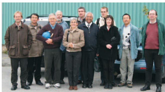
Members of Task 36 at the second meeting in Montreal, Canada in October 2004.