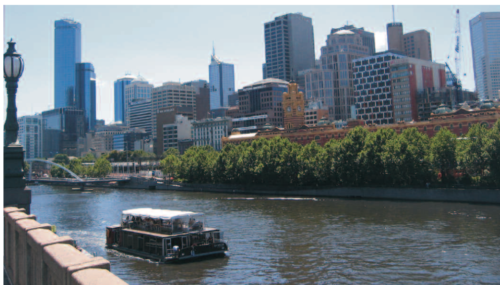
Melbourne, Australia, photo courtesy of Carl Wilén.

In December 2005 Task 36 presented papers at the Bioenergy Australia 2005 Conference, The theme of the conference was: 'Biomass for Energy, the Environment and Society'.