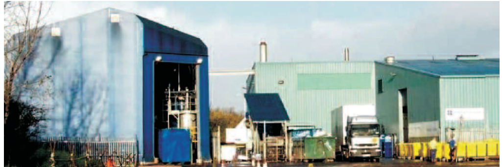
Compact Power Plant, photo courtesy of Compact Power.

Compact Power has developed a thermal process technology that is designed to deliver sustainable solutions for the safe and clean disposal of waste and the conversion of wastes and biomass material into renewable sources of energy.