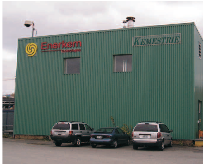
The Biosyngas-Estrie (ENERKEM) Pilot Project, Sherbrook, Quebec.

gasification takes place in a few seconds. The syn-gas is composed of nitrogen, carbon dioxide, carbon monoxide, hydrogen and small amounts of light hydrocarbons and some solid particles (char). Secondary reactions take place in the reducing environment that prevents the formation of oxidized species such as SO 2 and NO x . Free chlorine is never formed.