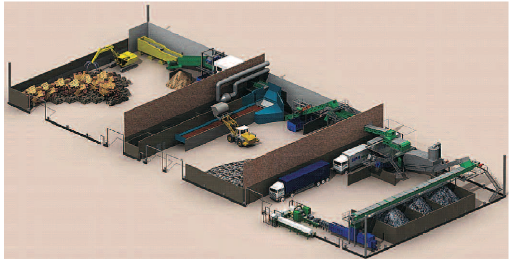
The SRF processing plant in Turku courtesy of Lassila & Tikanojas.

The Lassila & Tikanojas (L&T) Company focuses mainly on waste collection, but in response to demands of the landfill Directive, a new L&T Solid Recovered Fuels (SRF) plant with a capacity of 70,000 tonnes has been opened. Permission to increase to 1M tonnes at different sites across the country has already been approved. The main input material is commercial waste, mainly packaging material, that has a much more consistent composition compared to MSW. The SRF produced is supplied to power companies for co-firing, mainly paper and pulp companies, and cement kilns. The SRF has a biogenic fraction of 65% (on energy basis) and a heating value of 18MJ/kg. Since there are at present no international standards for SRF, the L&T Company works with the national standard (SFS 5875). The company is responsible for the quality of the SRF supplied to customers and therefore must guarantee the products sold. SRF production from commercial waste is expected to expand rapidly in Finland. It is also expected that a mature market for SRF as a fuel for co-firing in power plants is likely to be established in a fairly short time, despite the strong possibility that SRF will continue to be treated as a waste.