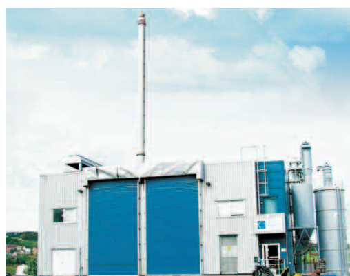
The Energos Plant at Ranheim, Norway.

In May 2004, Task 36 visited the first full-scale Energos (former AITOS) energy recycling plant for waste materials (plastics, paper, wood). The plant's low emissions of dust, SO x , HCl, CO and NO x , combined with high-energy utilisation, satisfied the EU requirements by a wide margin.