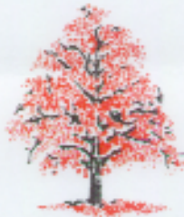
FLAME TREE SHIRE FLORAL EMBLEM