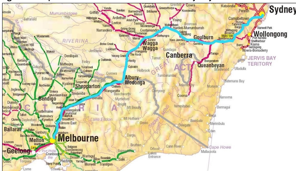
Figure 1: Map of rail corridor between Melbourne and Sydney