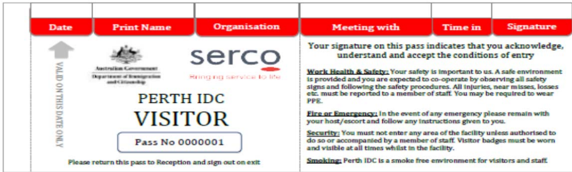
Figure 1. Front