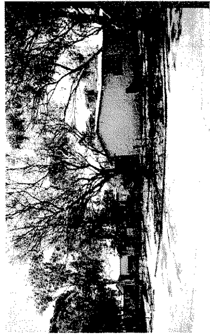
Woomera Residential Housing Project

While the configuration of the proposed Port Augusta RHP will depend on the site selected, it is expected that the arrangements that have proven successful in the Woomera RHP would be replicated at Port Augusta.