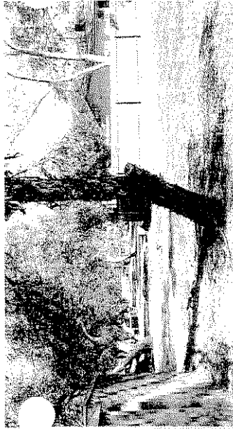
Woomera Residential Housing Project