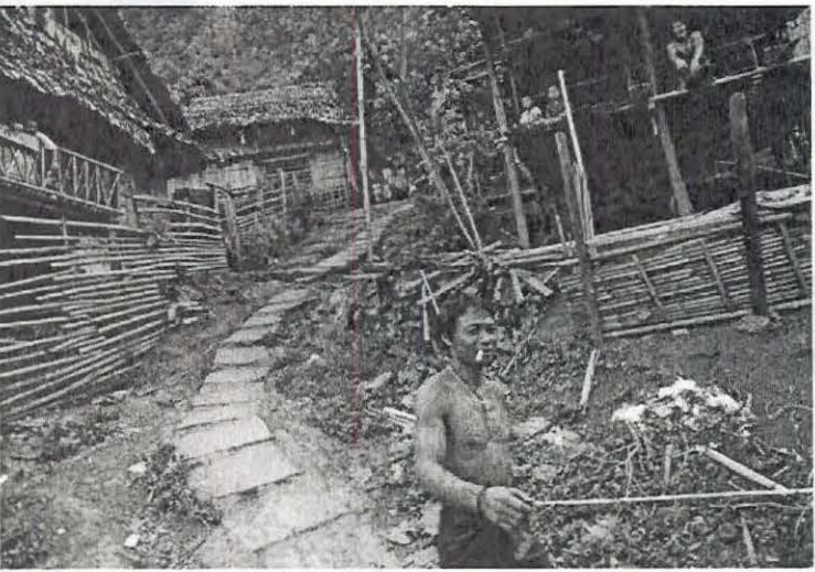
A refugee walks past wooden houses at the Mae La refugee camp on the Thai-Myanmar border

Both the Thai and Myanmar governments have agreed that they will abide by those principles.