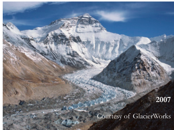
Main Rongbuk Glacier (see inside page)