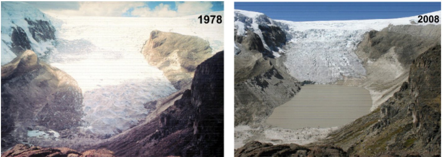
Qori Kalis outlet glacier (the largest outlet glacier from the Quelccaya Ice Cap in the southern Andes of Peru).

Mountain glaciers are lethally vulnerable to ongoing climate change