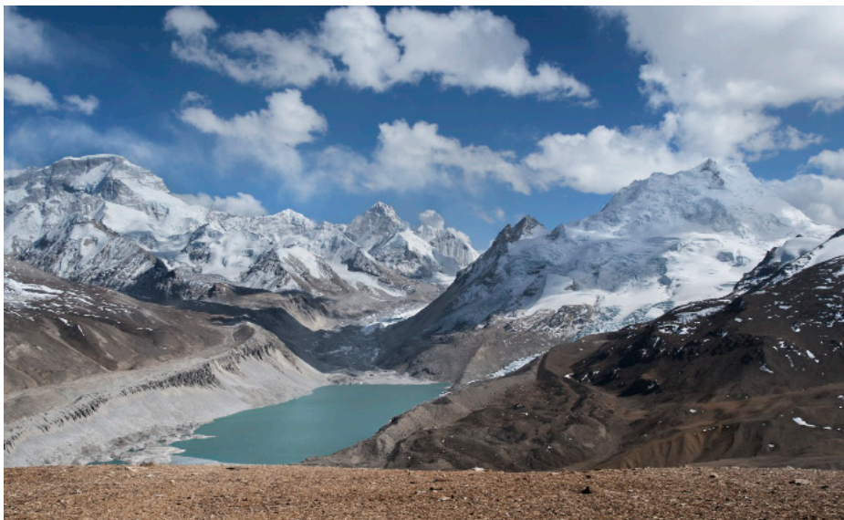
Kyetrak Glacier 2009