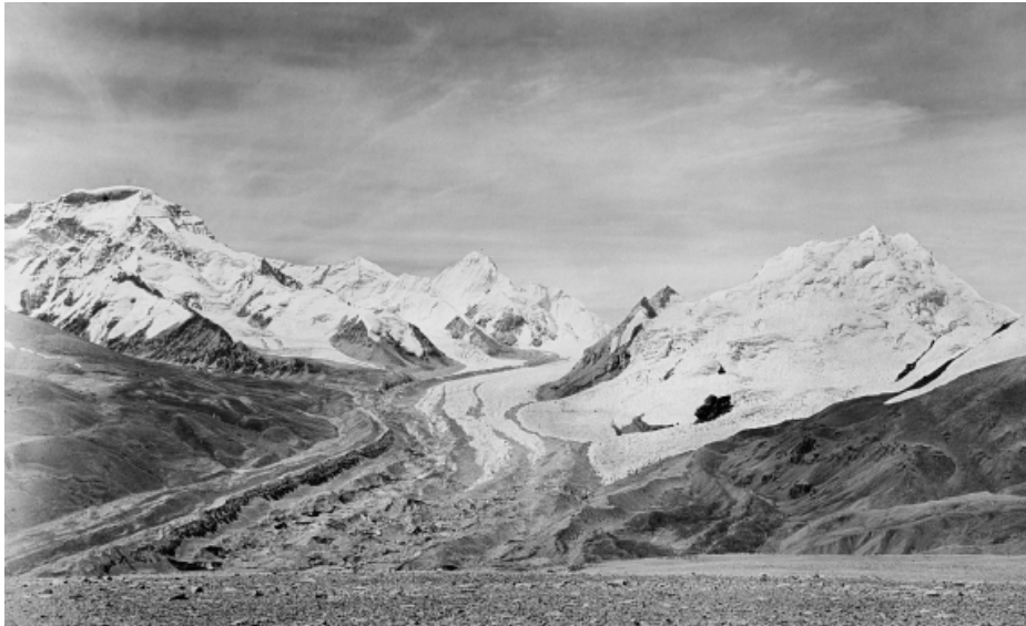
Kyetrak Glacier 1921. Location: Cho Oyu, 8201 m, Tibet Autonomous Region; Eastern Himalayas . Elevation of Glacier: 4,907 – 5,883 m.