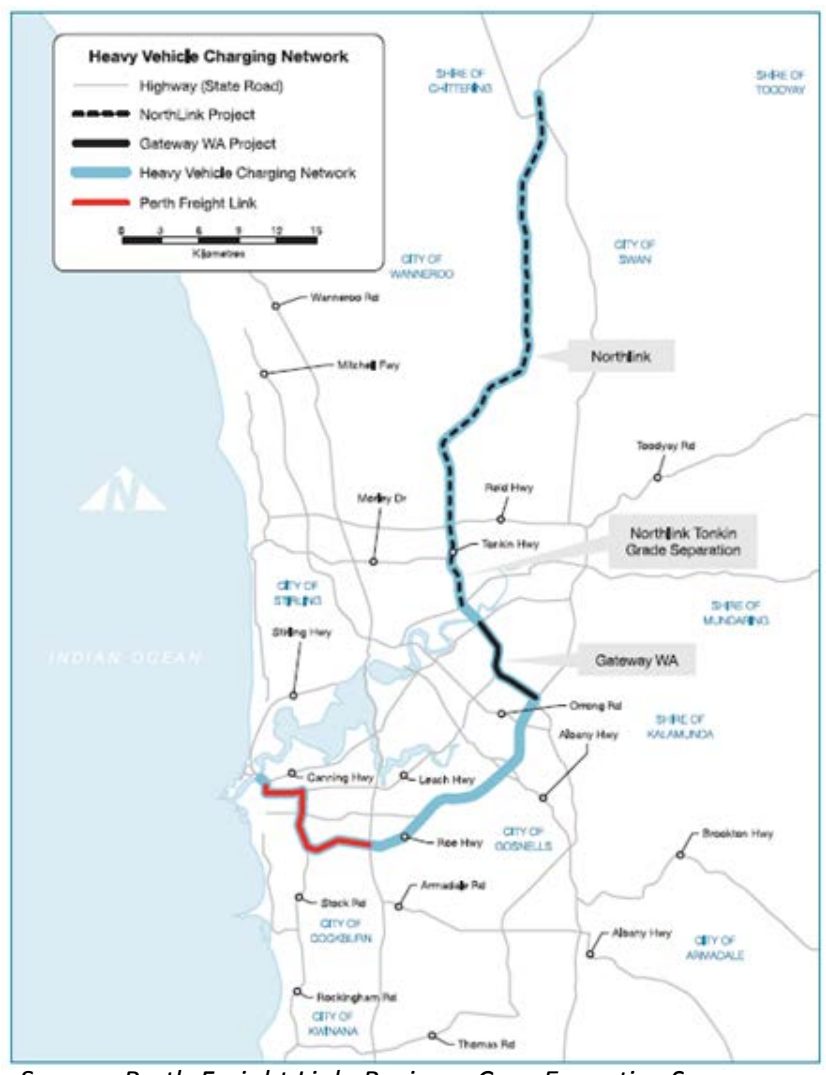
Figure 2: The proposed Heavy Vehicle Charging Network (Freight Link highlighted in red)

investment in the project to $925 million'. According the department, this total funding commitment included $59 million earmarked for Leach Highway/High Street Fremantle upgrades in the 2013-14 Budget. 25