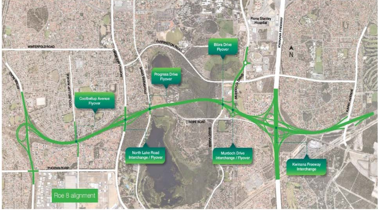
Figure 5: Preferred route for the Roe 8 extension (as at 12 August 2015)