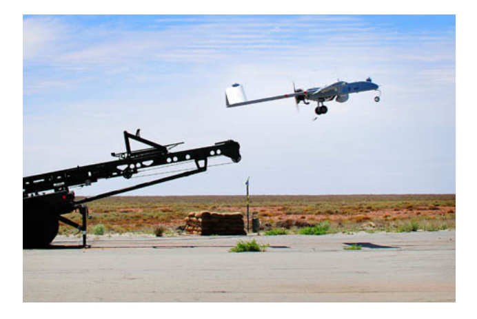
Figure 2.7 – Shadow UAV launch<sup>41</sup>

2.28 The Defence submission outlined that the 'Joint Project (JP) 129 will continue to support and update the Shadow 200 UAS capability as used in operations in Afghanistan predominantly by ground forces' and 'the project will also seek to procure small tactical UAS capabilities to support tactical ISR'.<sup>40</sup>