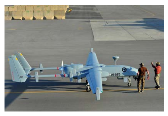
Figure 2.6 – Heron UAV<sup>38</sup>

In October 2014, the former Minister for Defence announced that Air Force would be returning a limited Heron-1 capability to Australia following the end of its mission in December 2014. Australia will operate two Heron-1 platforms in Australia to support the integration of complex UAS into the Australian environment. The repatriation will also support the retention and development of tactics and procedures for overland ISR gained during four years of Heron operations in Afghanistan.<sup>37</sup>