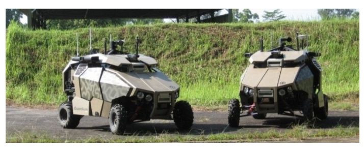
Figure 2.3 Guardium UGV<sup>27</sup>

25 US Department of Army, Request for Information: Counter Unmanned Aerial System Capability , 20 February 2014, available at <u>https://www.fbo.gov/index?s=opportunity&mode=form&id=94d4624458cac9978a69abc1ff6cc</u> <u>bd3&tab=core&_cview=0</u> (accessed 19 March 2015).