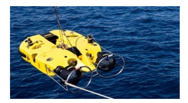
Figure 2.4 – Double Eagle UUV<sup>33</sup>