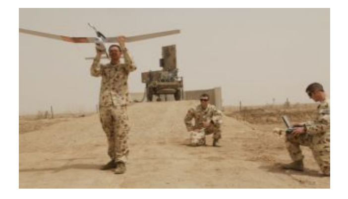
Figure 2.5 Skylark UAV launch<sup>36</sup>

2.25 The ADF has used tactical UAVs to support operations in Iraq and Afghanistan, in particular, the Skylark (Elbit Systems, Israel) and the RQ-11 Raven (AeroVironment, US). These are 'miniature' light weight short range UAVs which are launched by hand and usually equipped to provide 'over the horizon' ISR. The ADF has recently commenced training with the RQ-12 Wasp (AeroVironment, US).<sup>34</sup> The Defence submission noted the RAN is presently reviewing options for a small, tactical UAS to be employed in the provision of ISR for counter-piracy operations.<sup>35</sup>