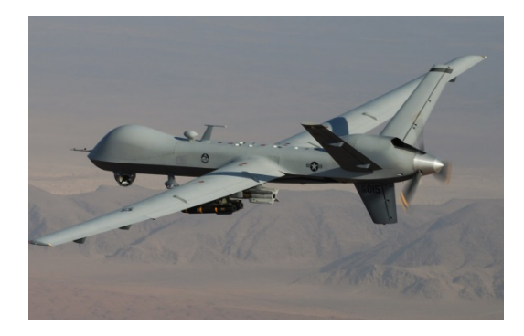
Figure 2.8 – US Reaper UAV^{47}

2.32 On 23 February 2015, the Parliamentary Secretary to the Minister for Defence, the Hon Darren Chester MP, announced that the RAAF had commenced training aircrew and support staff on MQ-9 Reaper (General Atomics, US) operations in the United States. The media release stated 'the training program provides a cost effective method to increase the ADF's understanding of complex UAS operations and how this capability can be best used to protect Australian troops on future operations'.<sup>45</sup> At the April public hearing, Defence confirmed six RAAF personnel were undertaking Reaper training in the US.<sup>46</sup>