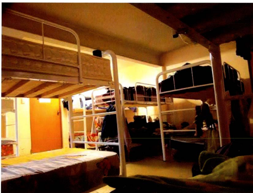
Picture 7.1: Accommodation for 417 visa holders employed in NSW meatworks