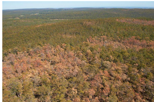
Mature jarrah forests suffering severe drought stress. April, 2011

Trials in the Wungong catchment trials have demonstrated the potential of silvicultural thinning to relieve stress in densely stocked stands, while at the same time making more moisture available for groundwater recharge and run-off. Active management of stand density in State forests offers the potential to simultaneously improve productive capacity, water yield and conservation of groundwater dependent ecosystems under threat from a drying climate. Sustainable harvesting by thinning 100,000 hectares of forest will reduce the cost of the required thinning, making the log products available for milling and biomass fuel, creating employment and generating renewable energy. The run-off into Perth's water supply dams is anticipated to increase at least 25 billion litres annually.