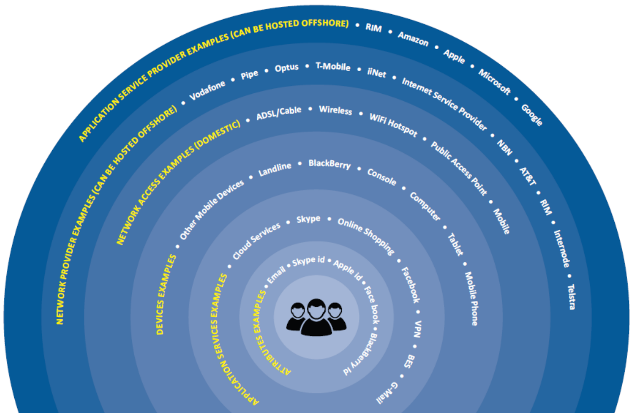
Figure 2: Australian Communications Environment - 2012