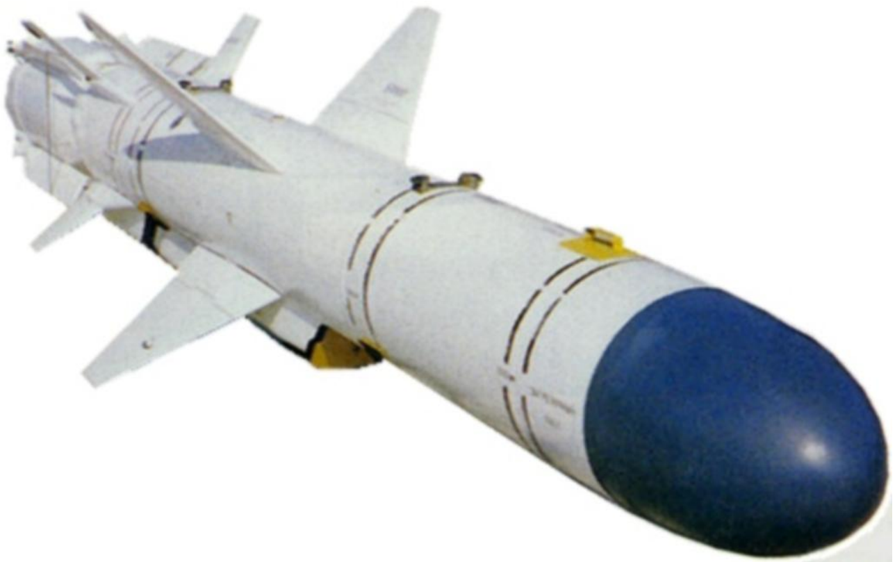
Figure 7: Dubbed the 'Kharpunski' the Kh-35U Uran is the Russian equivalent to the US RGM-84/AGM-84 Harpoon carried by the F-111C and RAN warships. The missile is available in surface launched and air launched versions.