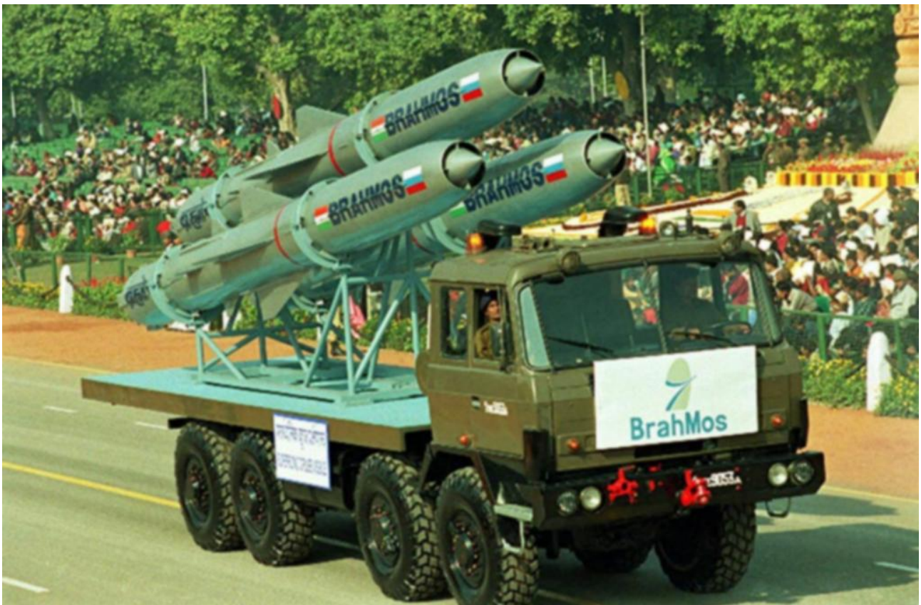
Figure 2: OKB-52 3K-55/3M-55 Yakhont. This supersonic sea skimming anti-ship cruise missile has been licenced to India for domestic manufacture. The missile is available in ship-launch, ground-launch and air launch variants, the latter marketed for the Su-30MK fighter. There is no Western equivalent to the Yakhont/Brahmos (Rosvooruzheniye/NIC).