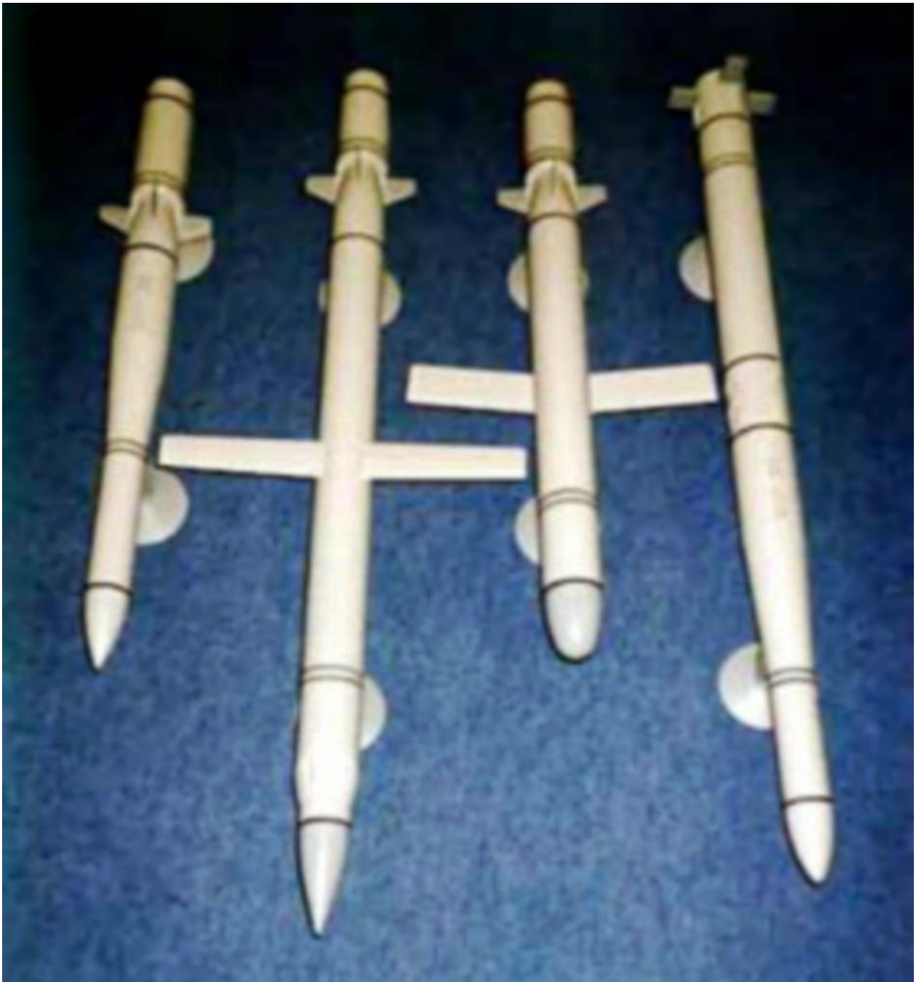
Figure 3: Novator 3M-54 Alfa/Club. This family of subsonic and supersonic sea skimming anti-ship cruise missiles has been exported to India and the PRC. The Alfa suite includes the subsonic 3M-54E1 anti-ship and 3M-14E land attack missiles which resemble a shortened Tomahawk, and the supersonic 3M-54E anti-ship missile. The Alfa is available in ship-launch, submarine-launch and air-launch variants, the submarine-launch variant is now in service. There is no direct Western equivalent to the 3M-54E (Rosvooruzheniye/NIC).