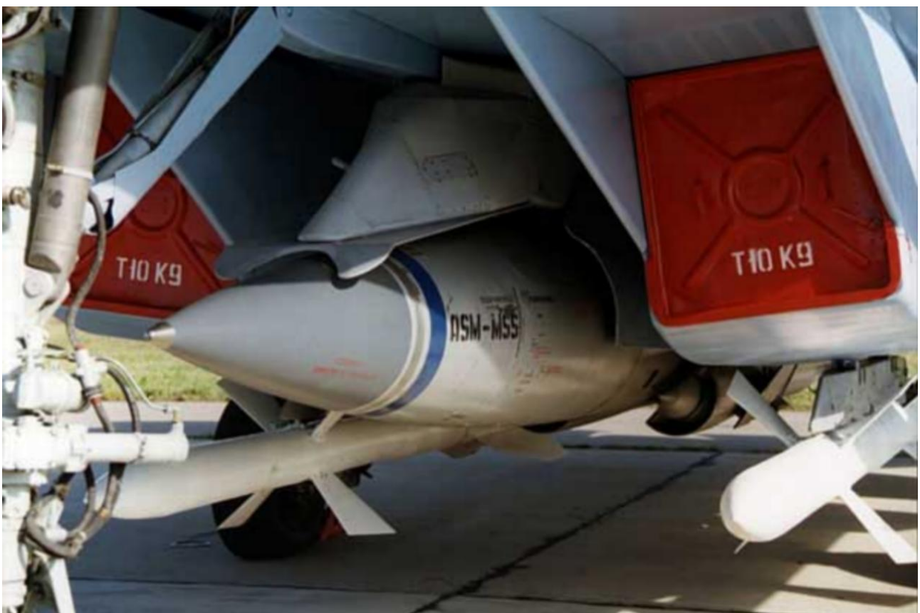
Figure 1: Raduga Kh-41/3M-80/3M-82 Moskit . This supersonic sea skimming anti-ship cruise missile has been exported to the PRC in its ship-launched variant. The missile is on offer as the air launched Kh-41 for the Su-30MK fighter. There is no Western equivalent to the Moskit ( Rosvooruzheniye ).