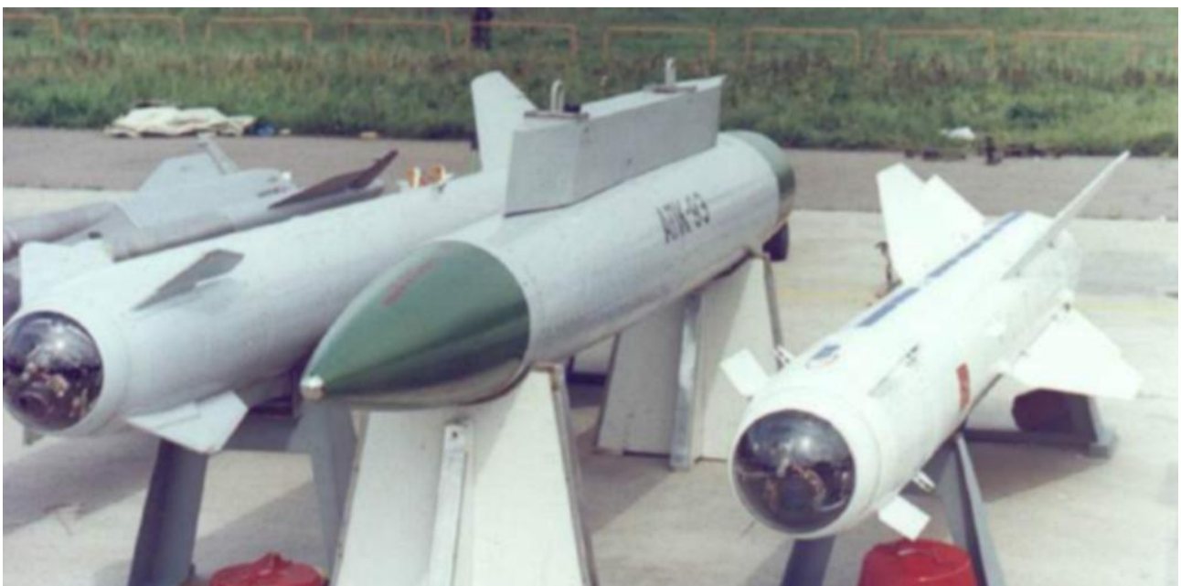
Figure 6: The Kh-59M/D series stand-off weapon is a direct equivalent to the AGM-142 missile now being integrated on the RAAF's F-111C. Evolved from an anti-radar missile, it is now available with an optical seeker. The PLA-N is reported to have ordered an anti-ship variant equipped with a radar seeker, designated the Kh-59MK2 (-).