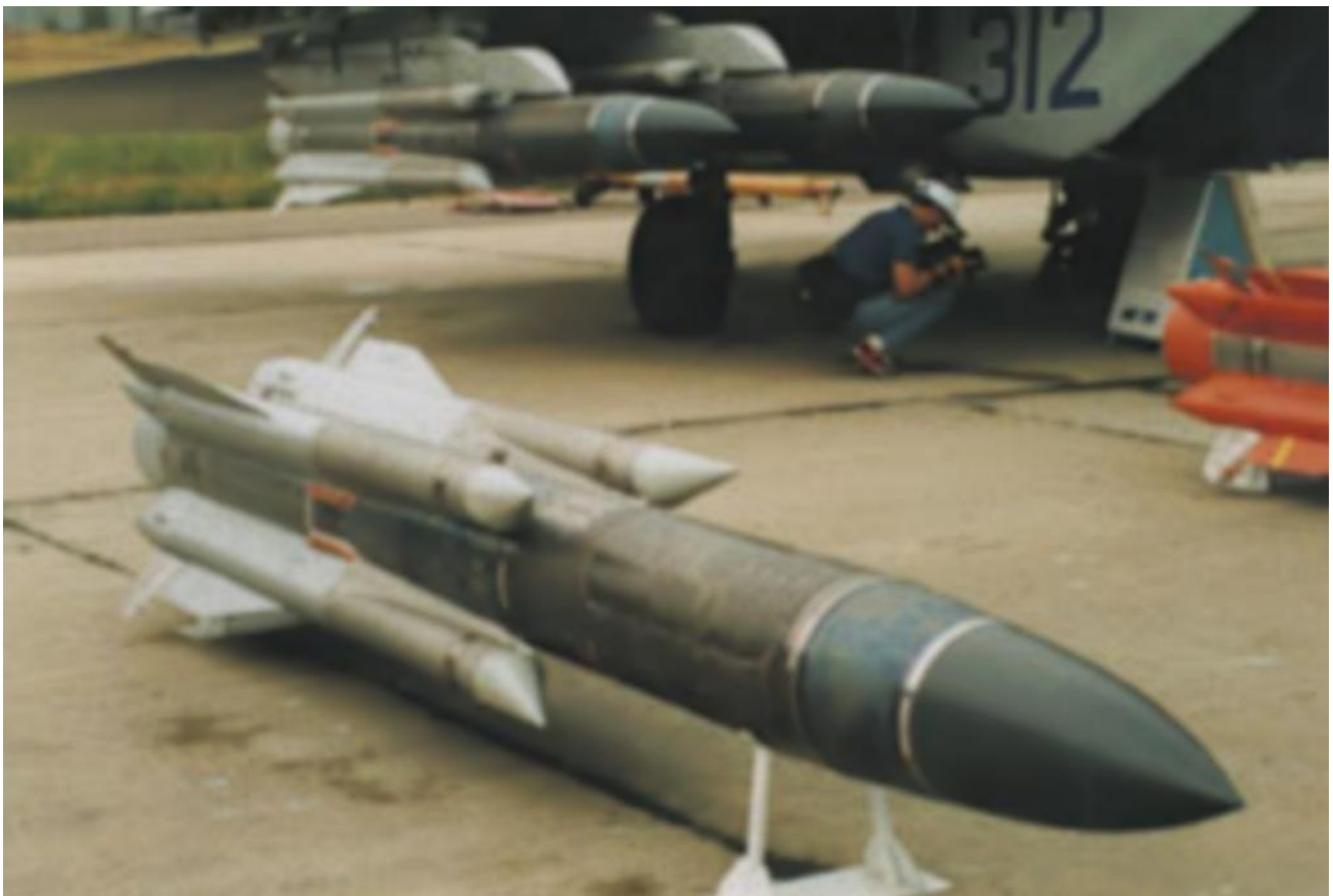
Figure 5: The supersonic ramjet Kh-31R was originally designed as an anti-radar missile to suppress NATO air defences. Since the end of the Cold War it has evolved an extended range variant, the Kh-31MR, and an anti-ship variant equipped with a radar seeker. the Kh31A/MA. It has no equivalent in the Western inventory. The PLA is reported to use this weapon (RuMoD).