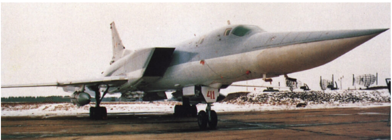
Figure 4: Kh-22M Burya . The Kh-22 series of supersonic cruise missiles was developed during the 1960s and is equivalent to the RAF's former Blue Steel missile carried by the V-bomber fleet. This Mach 3 missile is the primary weapon of the Tu-22M-3 Backfire C bomber, available in anti-shipping and land attack variants. Reports claim a mid life upgrade has been designed. Should India proceed with the lease of Backfires, the Kh-22M would be the likely weapon (US DoD, RuMoD).