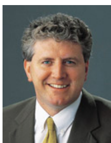
Mr Brendan O'Connor MP Deputy Chair