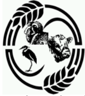
Australian Floodplain Association