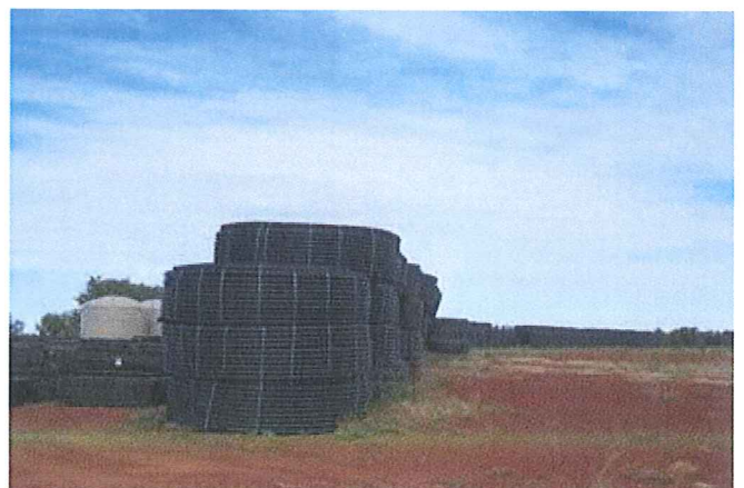
The necessary stockpile of fencing materials, water tanks and polypipe stretches to the horizon

Stock density can be increased to force cattle to graze a much higher proportion of the pasture than they would if left to roam much larger areas. The perennial pasture species are high value for grazing provided they are grazed early in the growing season. If they are not grazed early in the season they go to seed and soon lose nutritional value. Grazing each area in turn with a high stock density for a brief period – three days grazing with a mob of 6000 cattle units is the current aim – prevents loss of pasture value.