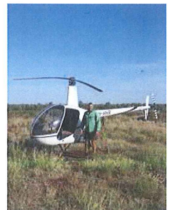
The helicopter provides both transport and safety capabilities

One person is employed full-time during the dry season to maintain the bores, tanks and trough system, including refuelling, servicing and repairs.