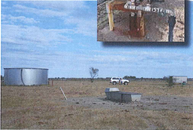
Water infrastructure now comprises a network of steel or plastic storage tanks, concrete or steel troughs and and bores Inset: A diesel bore pump

Work place safety is a major concern in this remote region. As well as ensuring all staff attend safety briefings, providing safety equipment and ensuring appropriate signs are in place around the sheds and homestead area, staff at Beetaloo Station are trained in first-aid. Using a helicopter for travel around the property has the dual benefits of enabling faster travel for work purposes and providing a means of rapid evacuation of an injured person.