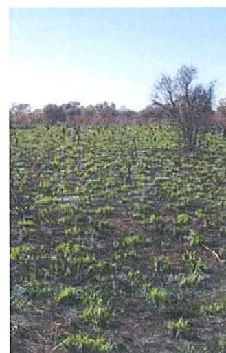
New grass shoots after burning

There are only two ways to ensure that the grasses remain useful for grazing: animal impact or burning. The grasses regenerate readily after burning, but at the cost of loss of organic matter, soil biota and volatile nutrients. Frequent burning degrades the soil. Conversely, brief periods of high pressure grazing consumes or knocks down the pasture before it goes to seed and senesces. This maintains pasture in a vigorous growing condition.