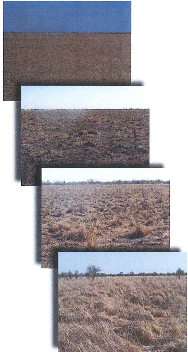
Top to bottom: Pasture at watering point; 1km away; 2km away; and 3km away from watering point

John could see the grazing potential in extensive areas of native pastures which were being very inefficiently used. Drawing strongly on his previous experience in the Kimberly, he saw the opportunity to develop, "A large scale, naturally sustainable cattle operation that is simple to operate, economically viable, environmentally sustainable, productively utilises all the available grazing area and aims at being an industry leader in low cost beef production".