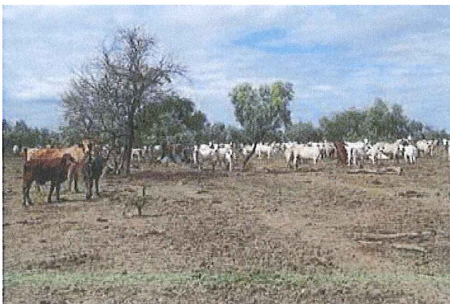
Cattle on degraded land close to a watering point

The cumulative effect of this form of grazing management is gradually declining grazing value, as the accessible pasture becomes degraded, increasing vegetation and soil degradation and loss of habitat for native species.