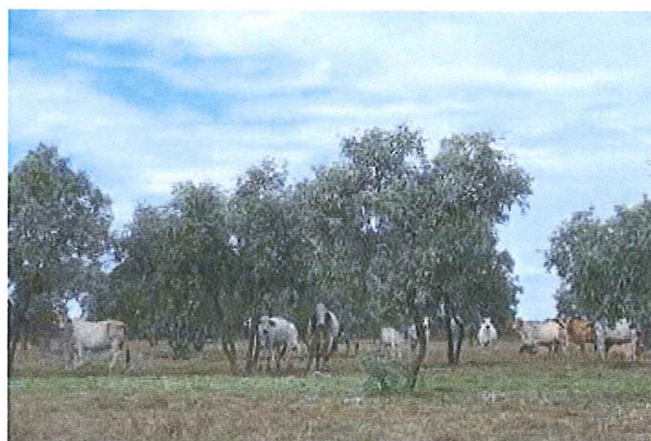
Cattle are bred to cope well in the tropical environment and are for resistance to ticks

"...a well organised, productive, sustainable business operation that will benefit the whole environment and landscape, without any unnatural side effects."