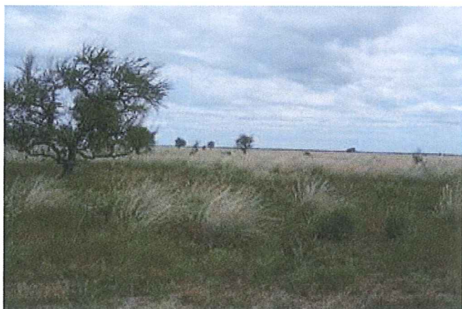
The pastures and soils are benefitting from the new grazing regime

At the same time, heavy grazing for a short period, together with the trough location that distributes cattle movement to four points within each paddock, prevents overgrazing, which discourages regeneration of annual species, and reduces soil degradation. Most importantly, short periods of intensive grazing build up soil condition and encourage pasture growth in the long term by breaking down senescent vegetation and litter and adding dung.