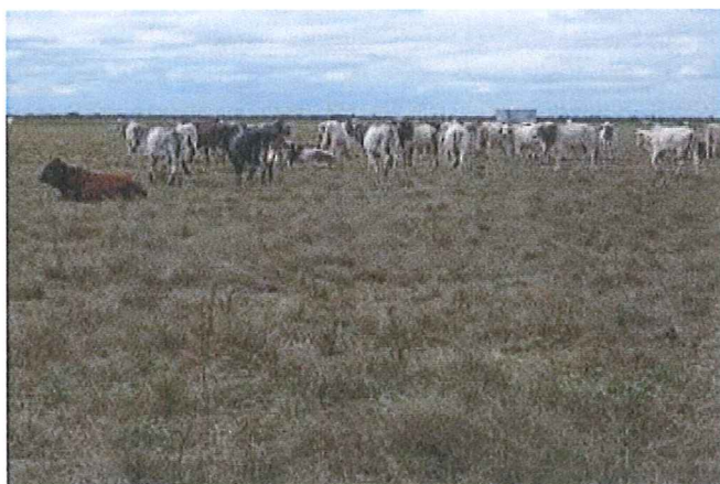
Cattle now graze previously untouched pastures due to the provision of water nearby