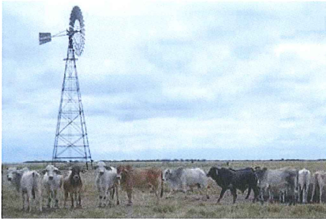
Water provision in traditional local grazing management was to pump bore water to open earth tanks then troughs, resulting in substantial evaporation