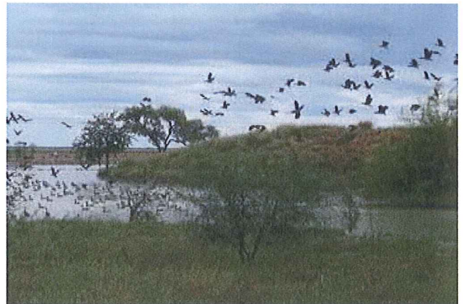
Wetlands and waterholes support significant biodiversity

Water birds, including pelicans, ducks and brolgas, are prolific on the wetlands, temporary waterholes and earth tanks. Wedge-tail eagles, kites and other raptors are a common sight.