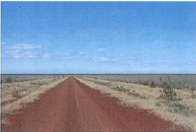
Beetaloo Station extends over one million hectares

Beetaloo Station is vast. The total area of Beetaloo and OT Downs is 707,800 hectares and the Mungabroom property is 346,900 hectares. Combined, the total area is 1,054,700 hectares or 10,547 square kilometres. The distance from west to east is approximately 130km and from north to south about 120km - as the brolga flies. Approximately 50,000 cattle are currently run on the properties.