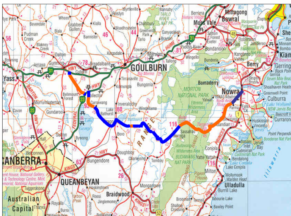
Figure 5.1 Main Road 92