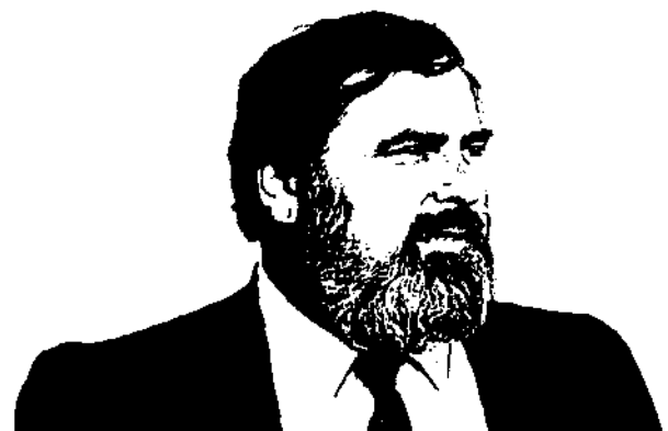
Dick Adams Federal Member for Lyons

A handwritten signature in black ink, appearing to read "Dick Adams", with a long, sweeping horizontal line extending to the right.