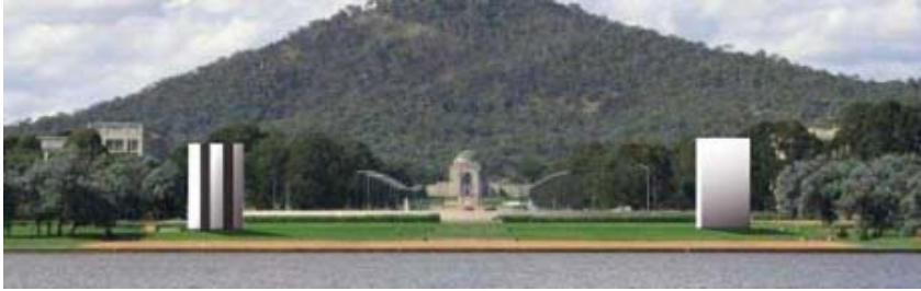
Photo montage Karina Lee, reproduced with permission of the Lake War Memorial Forum