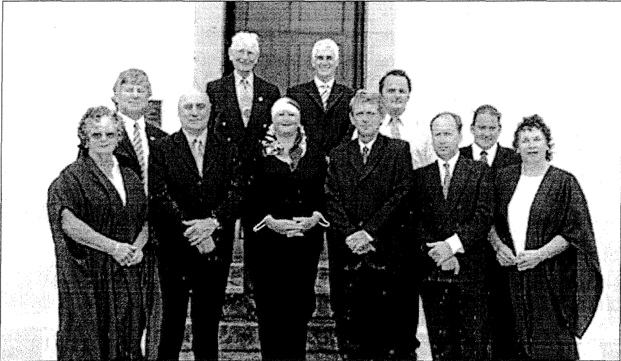
The Members and clerks of the 12th Assembly.

tions. The first occurred when the whole population agreed to the transfer from Pitcairn to Norfolk Island, only to find that the commitment that had been made to them that the island would be given to them for their exclusive occupation was not to be honoured. The second occasion was in 1979, when the Norfolk Island Act granted self-government, and appeared finally to promise certainty and the opportunity to govern according to the spe-