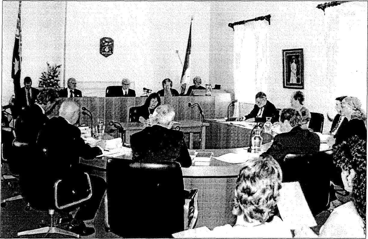
The first sitting of the 11th Assembly in the Norfolk Island chamber.

frage. At this time, the people come under the British Crown.