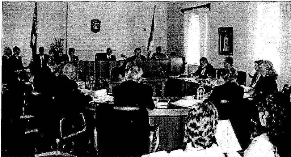
Legislating for Norfolk Island by Islanders.

Mr Lloyd acknowledged the 25 years of self-government, recording the uniqueness of the level of self-government provided to Norfolk Island and the range of powers and functions entrusted to the Legislative Assembly – local, state and federal powers – and complimented the successive Legislative Assemblies in developing a significant body of law along with the ability to deal with the breadth of issues over which they had carriage.