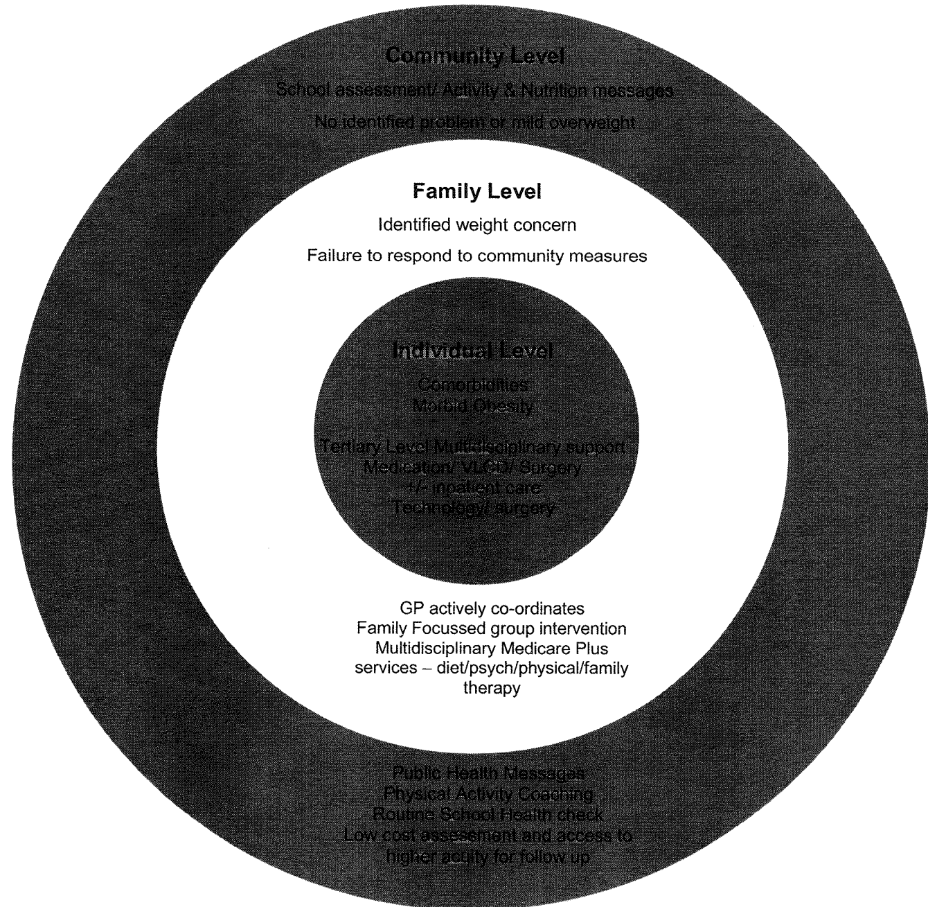
Figure 2. Targeting Australia's Health Problem