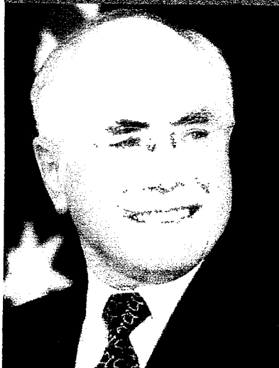
JOHN HOWARD PRIME MINISTER

You will be given a Green and a White ballot paper when completing your ballot papers. DO NOT cross out or cross off your name or make a mistake in case you need a new ballot paper.