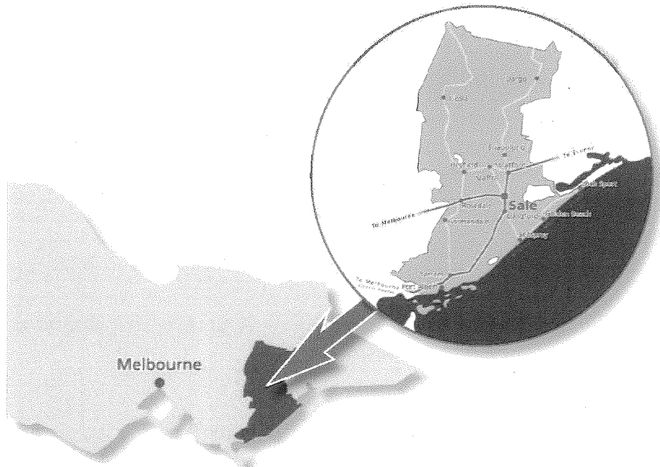
Wellington Shire, Victoria, Australia