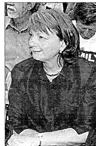
Federal Member for Murray Sharmar Stone . . . This is the perfect storm. (If the basin plan is implemented) the metros (city dwellers) will clap and cheer, the Greens will say 'well done'.

Quotable quotes from the MDBA's Echuca consultation session and the farmers' protest rally that came with it.