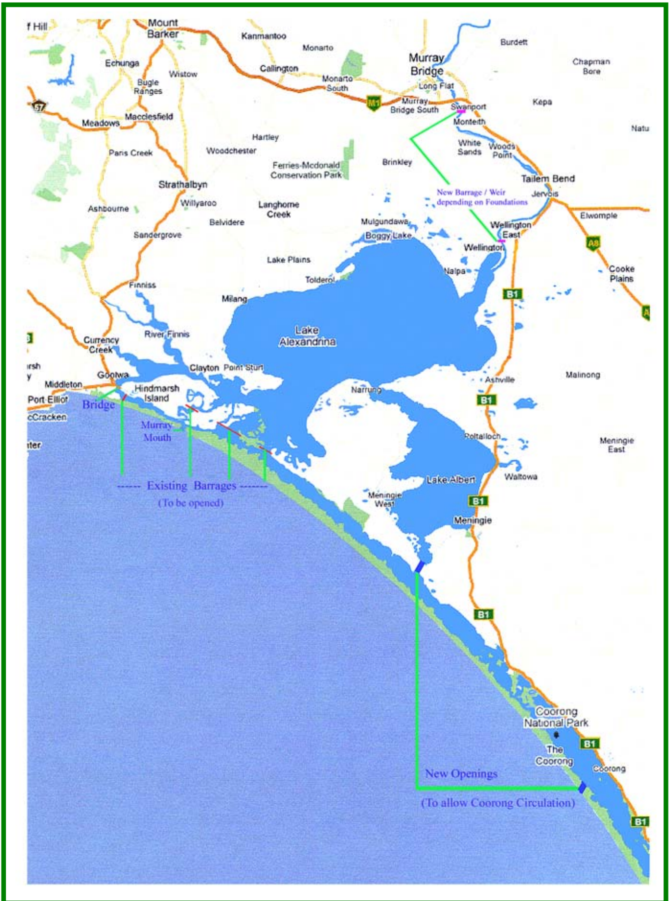
Figure 1 Showing the Changes to be made at the mouth of the Murray River