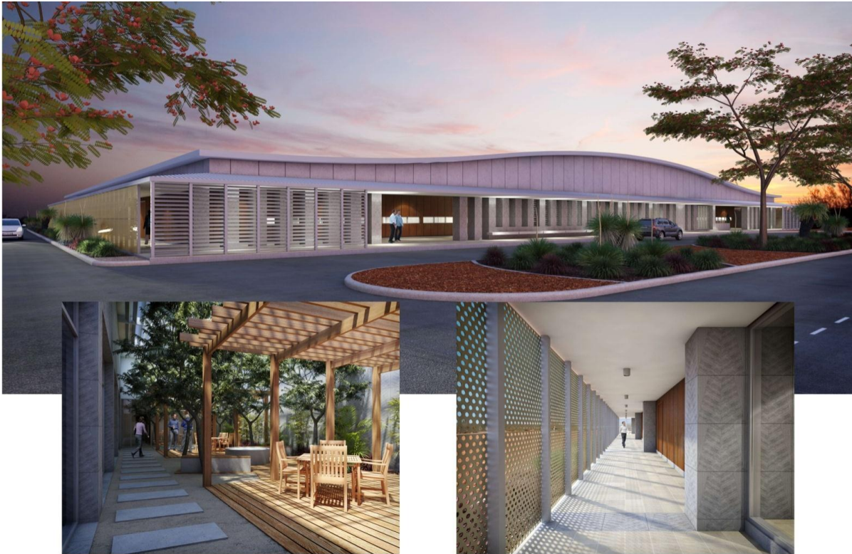
Figure 4: Image of the Central Facilities Building in Wickham to provide catering and recreational amenity for Wickham FIFO employees and residents.

Other features of the new Wickham FIFO facilities include: