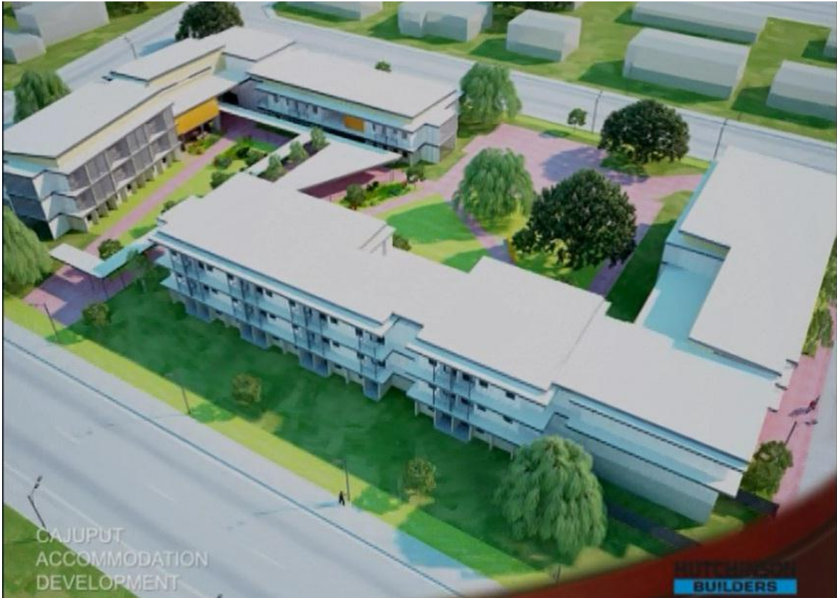
Figure 1: Aerial impression of Cajuput Villas development on Wickham Drive

The following pictures illustrate the Wickham FIFO development.