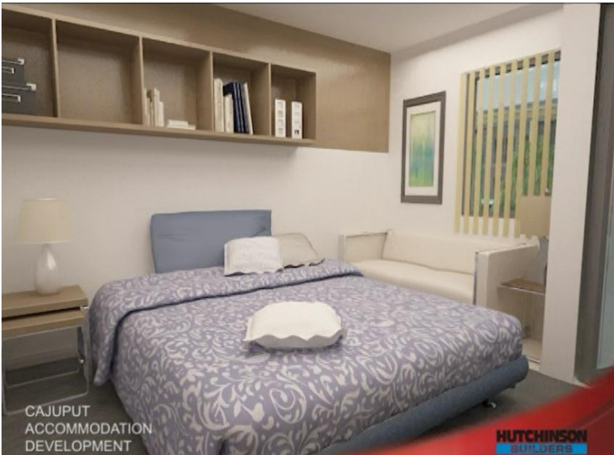
Figure 3: Interior view of Cajuput FIFO accommodation rooms