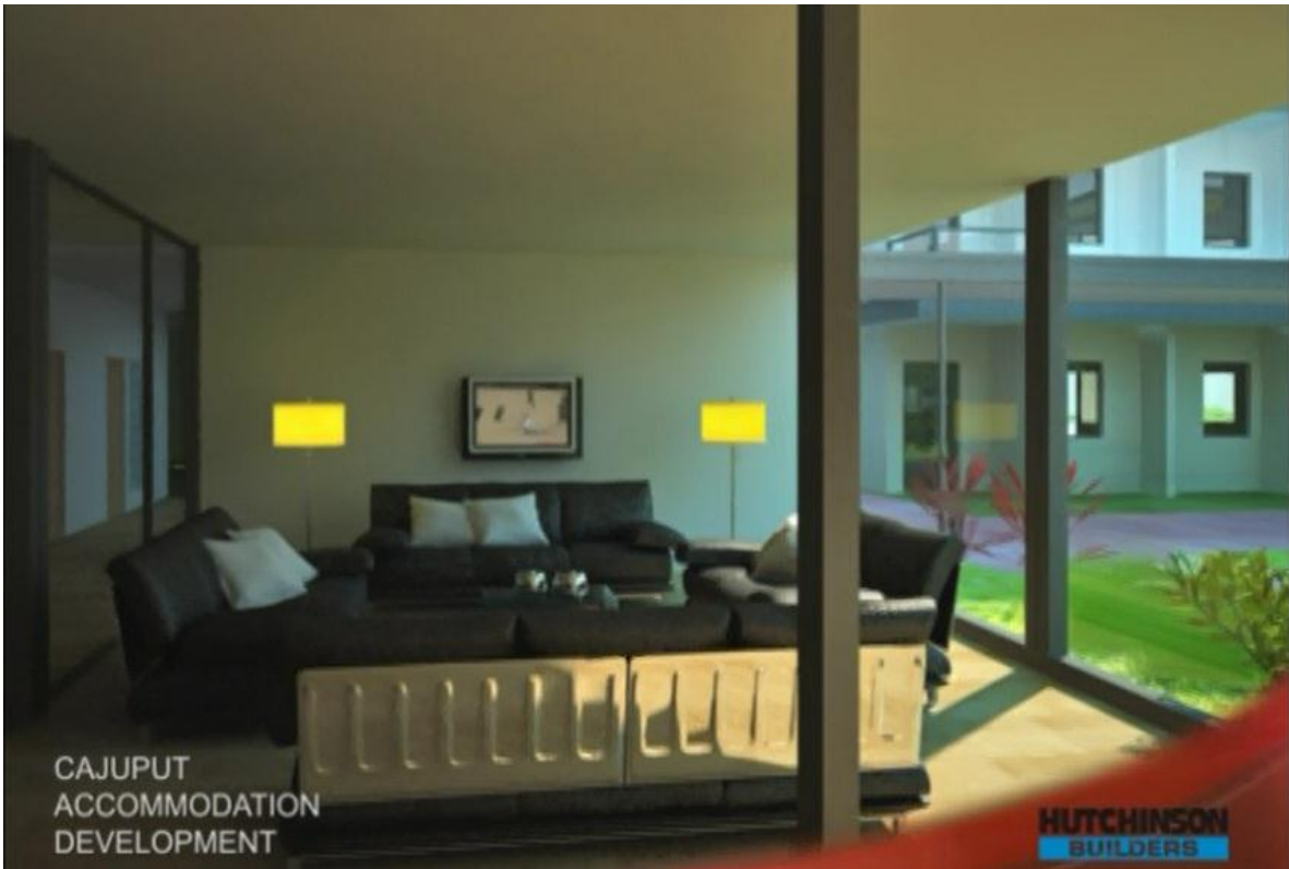
Figure 2: Impression of transit lounge breakout area