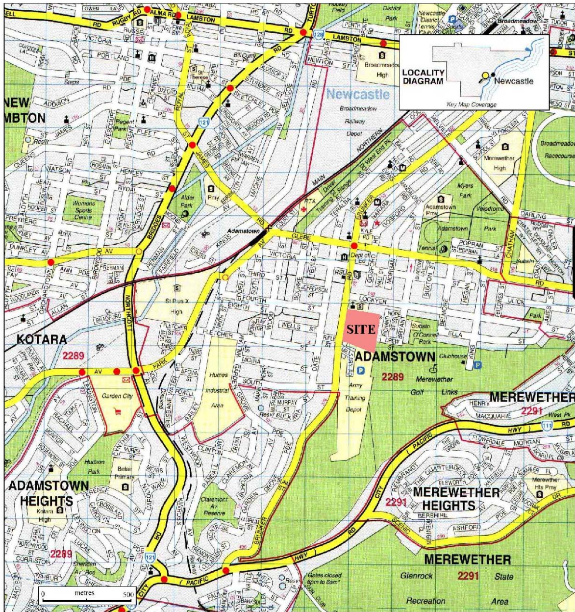
Figure 1: Site Locality Map