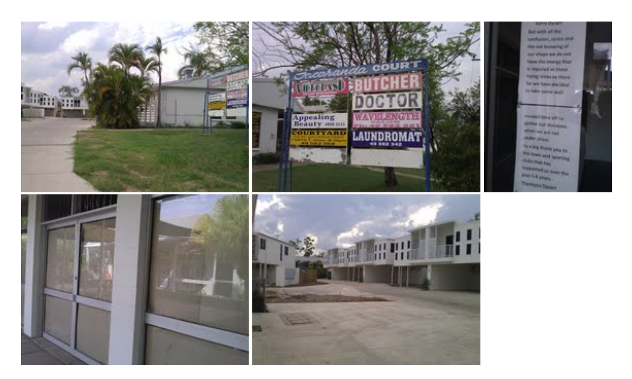
1.Jacaranda Court with new 3Br units to the left 2.Business that used to be here accommodation 6.Rear view of Jacaranda Court showing Stage 1 & 2 units