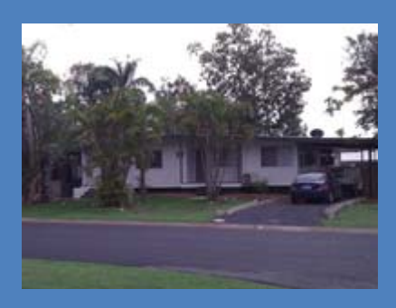
Middle Crescent, Dysart.

The builder advised a neighbour that the inside of this property had been altered and now has 10 bedrooms and 2 kitchens. IRC's only comment to date, 'there is no planning approval for this.'