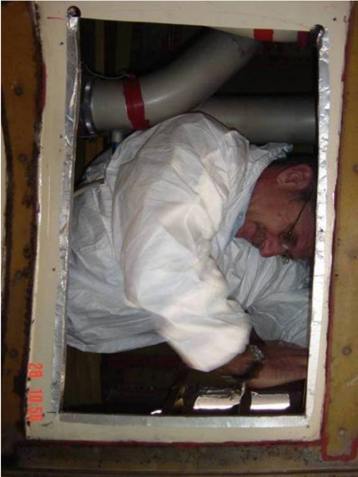
Figure 8: Coping with cramped working conditions