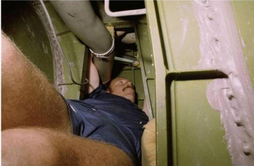
Figure 9: Working in the confines of a fuel tank with no Personal Protective Equipment