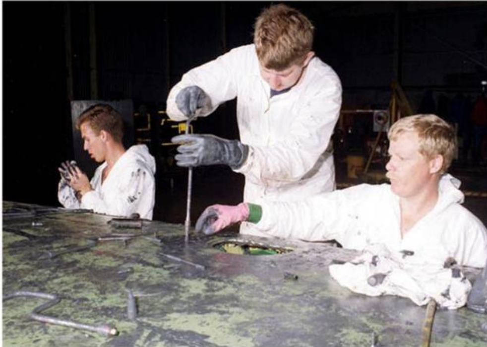
Figure 7: Inconsistent use of Personal Protective Equipment