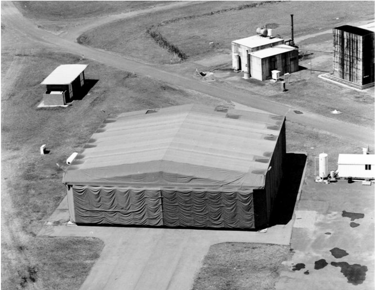
Figure 5: The newly constructed 'rag hanger' at Amberley