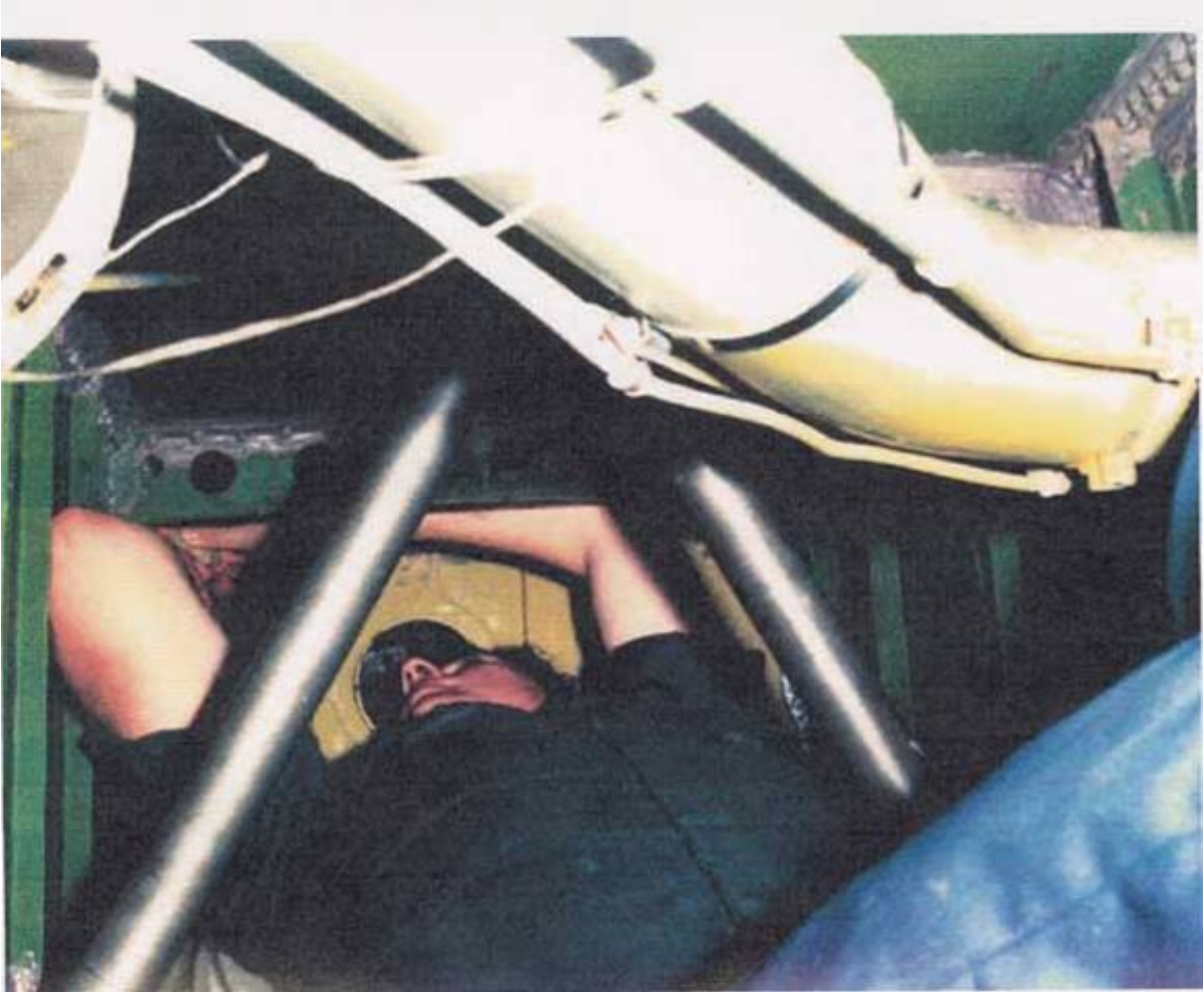
Figure 6: Working in the confines of a fuel tank with no Personal Protective Equipment