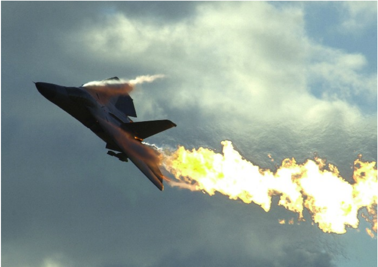
Figure 10: The F-111 as many Australians know it