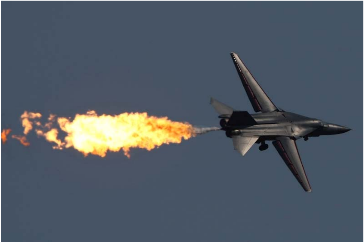
Figure 1: The F-111 as many Australians know it