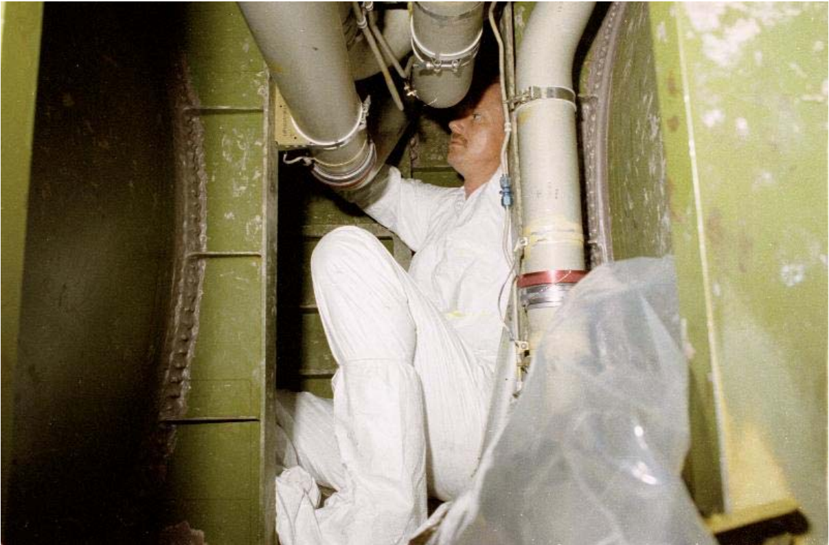
Figure 4: Confined work area