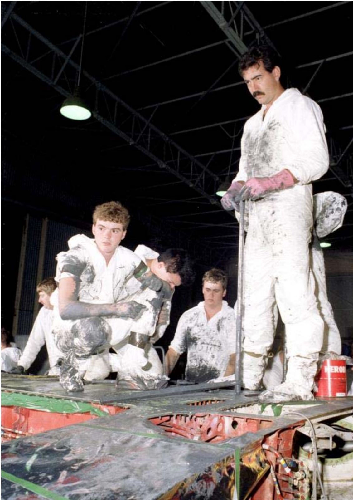
Figure 3: Inadequate use of Personal Protective Equipment