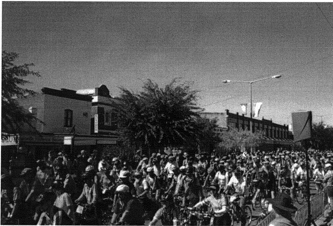
MANILLA - RTA BIG RIDE - APRIL, 2002