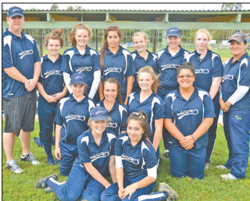
The ACT WhiSPers team after their game against the NSW girls.