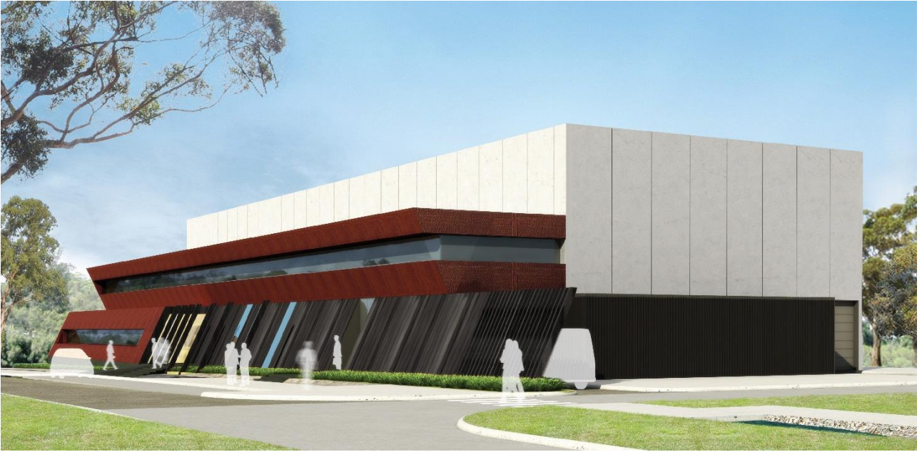
Figure 1: Nuclear Medicine Manufacturing Facility – South Western Perspective