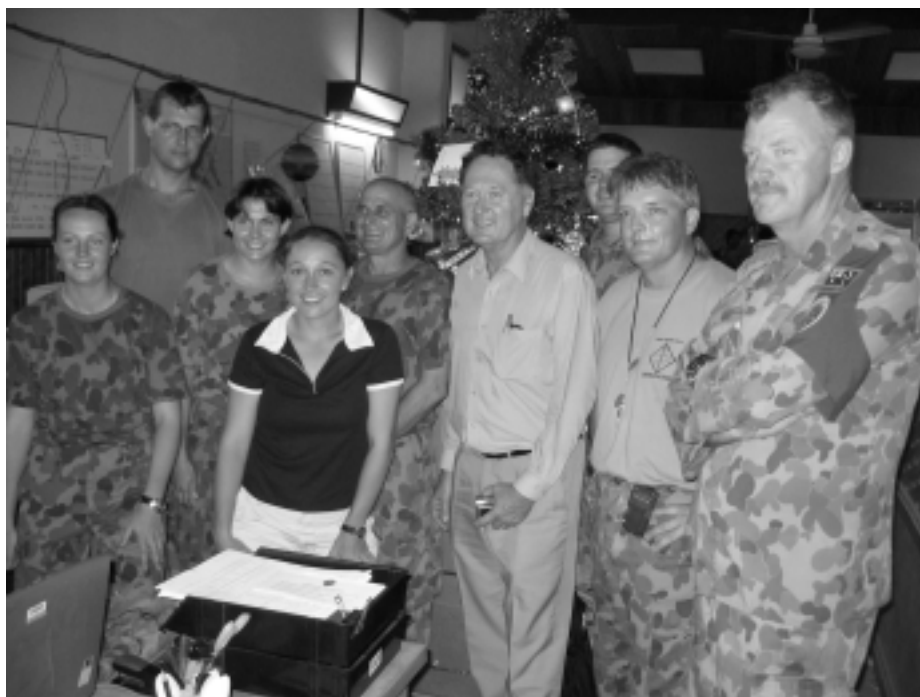
Figure 1.4 ADF personnel at RAMSI Base, Honiara