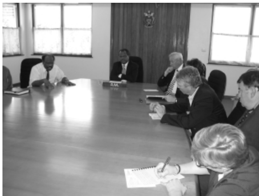
Figure 1.6 Meeting with the Prime Minister the Hon Sir Allan Kemakeza and senior Ministers