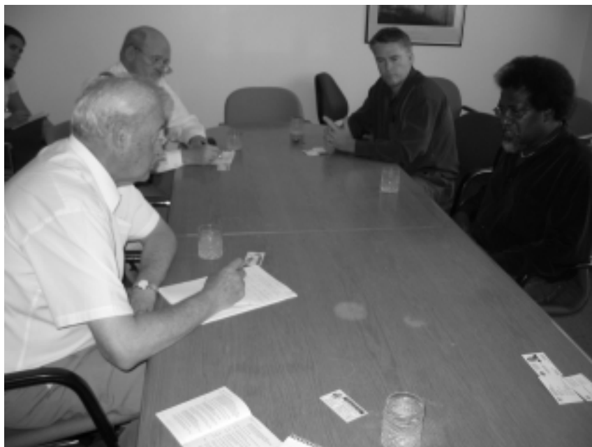
Figure 1.5 Meeting with Opposition Members of the Parliament of the Solomon Islands