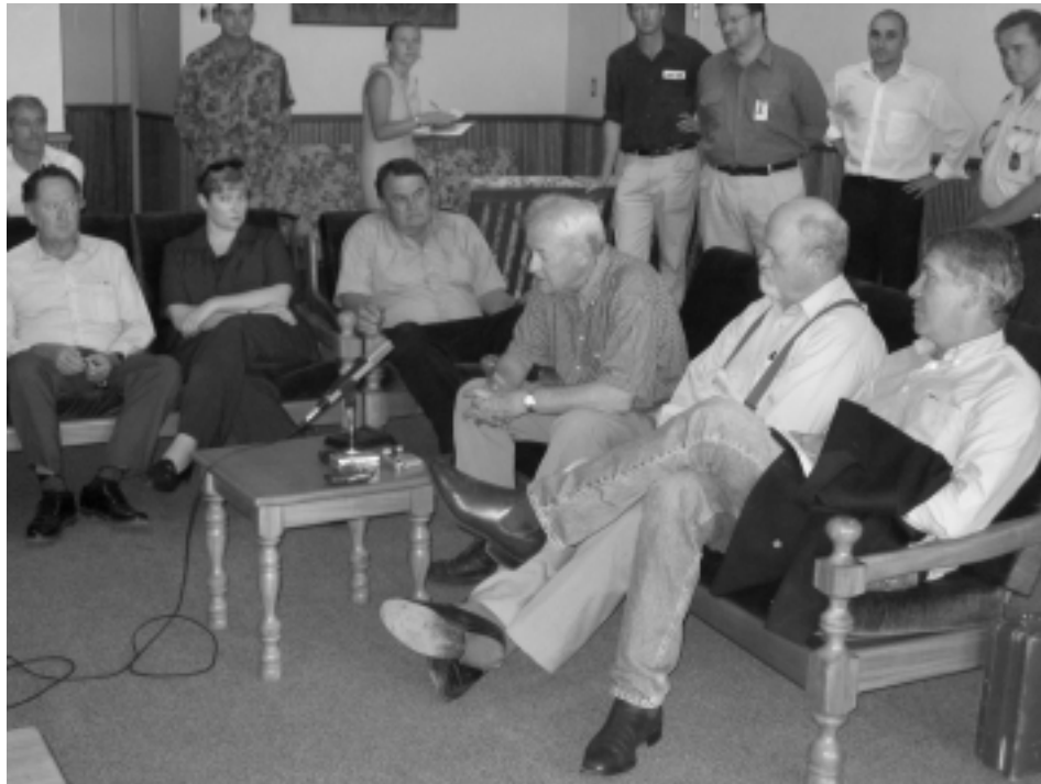
Figure 1.7 Press Conference at Honiara Airport