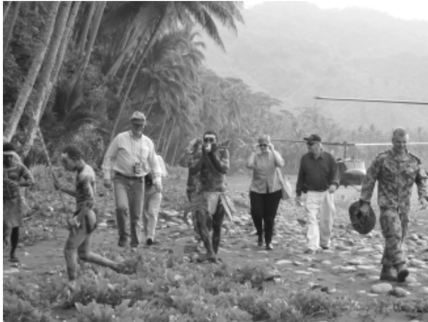
Figure 1.1 The delegation arriving at Isuna (Weathercoast)