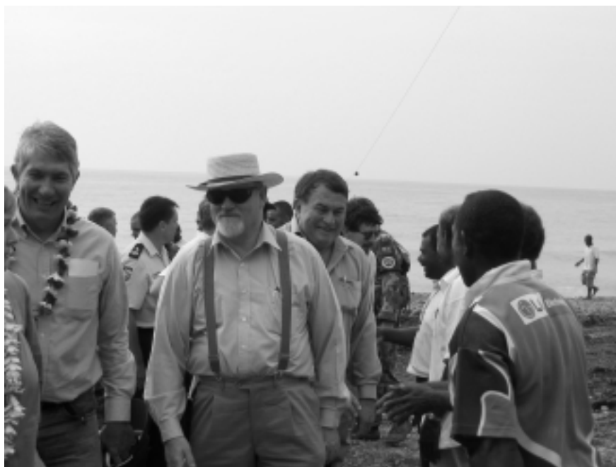
Figure 1.2 Meeting with community representatives at Isuna (Weathercoast)