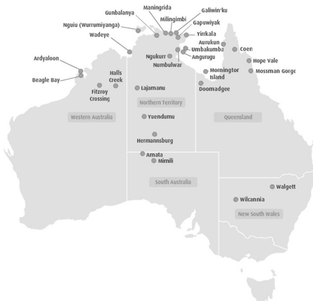
Figure 3.1 The NPARSD priority communities