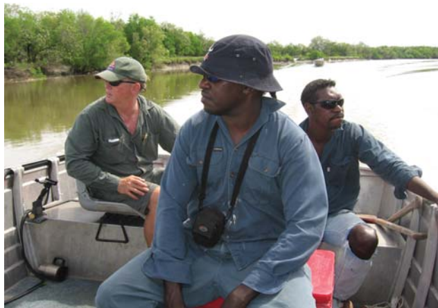
Wild River Rangers

In line with Indigenous Employment Policy for Queensland Government Building and Civil Construction Projects, QPWS ensures its government initiatives on Cape York employ a minimum 20 per cent Indigenous people.