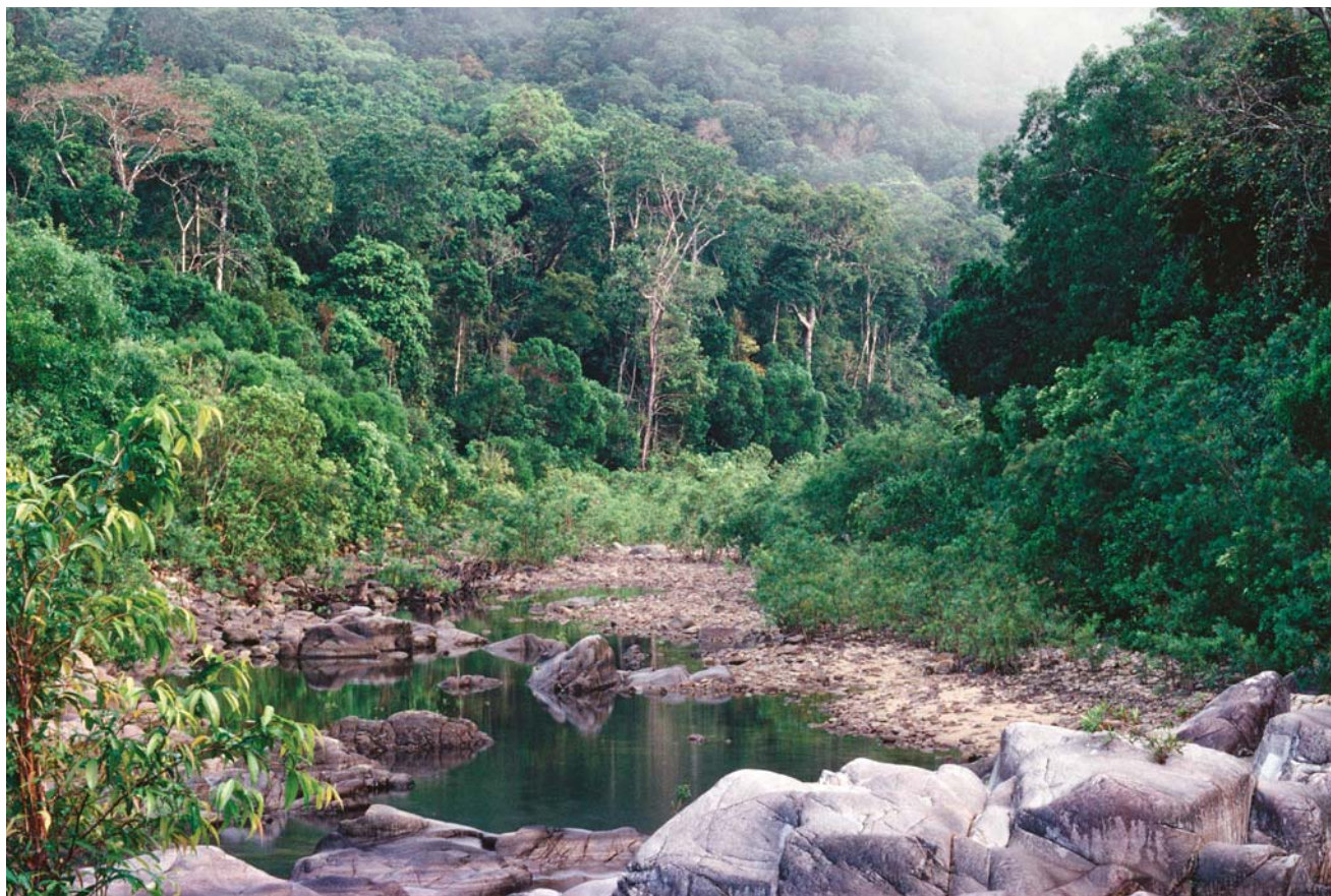
Chester Gorge, Lockhart River

Restoration costs for the Murray–Darling highlights the complexity of restoring a large river system. The Lake Eyre Basin, a proposed wild river area, is comparable in size to the Murray–Darling, and, given the significant natural and economic values of this system, is worthy of protection. The near-natural state of the Lake Eyre Basin rivers presently supports a tourism industry worth over $80 million ( http://www.lebmf.gov.au/basin/tourism.html ) and agricultural industry worth over $270 million ( http://www.lakeeyrebasin.org.au/archive/media/bground.pdf ). This alone highlights the importance of its nomination as a wild river area, supporting the argument for protection.