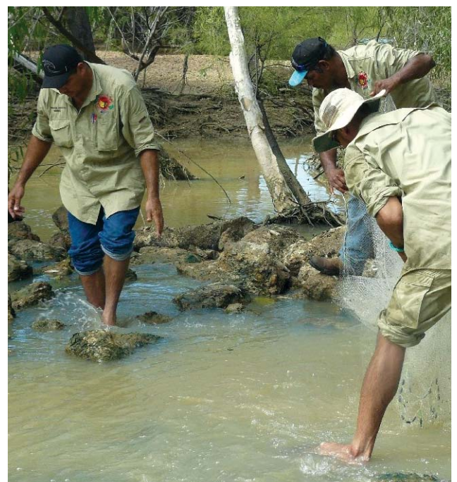
Gulf Rangers, fish survey