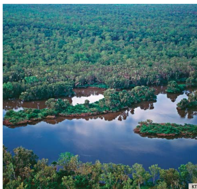
Coastal lagoon, Stewart River

A recent study into the economic activity of Australia's World Heritage areas found management of, and visitation to, these areas can have significant economic impacts at regional, state and national levels. (Gillespie Economics et.al. 2008). While the potential benefits of a World Heritage listing for Cape York have yet to be fully identified, the experience with other World Heritage properties, such as the Tasmanian Wilderness, Kakadu, Uluru–Kata Tjuta and the Great Barrier Reef, World Heritage nomination has greatly increased tourist visits from overseas and within Australia.