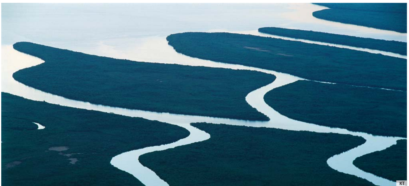
Missionary Bay, Hinchinbrook Island

Similarly, the Minister met with the Director of the Cape York Institute and discussed greater opportunities for Indigenous participation in consultation, greater assistance to Indigenous economic development and greater security for the employment of Wild River Rangers. A letter was subsequently delivered to the Institute (see Attachment 2) on 24 December 2009, and despite a commitment to consider the proposals the Queensland Government has yet to receive a response.