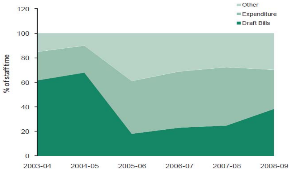
Figure 2- Division of Scrutiny Unit Staff time by session