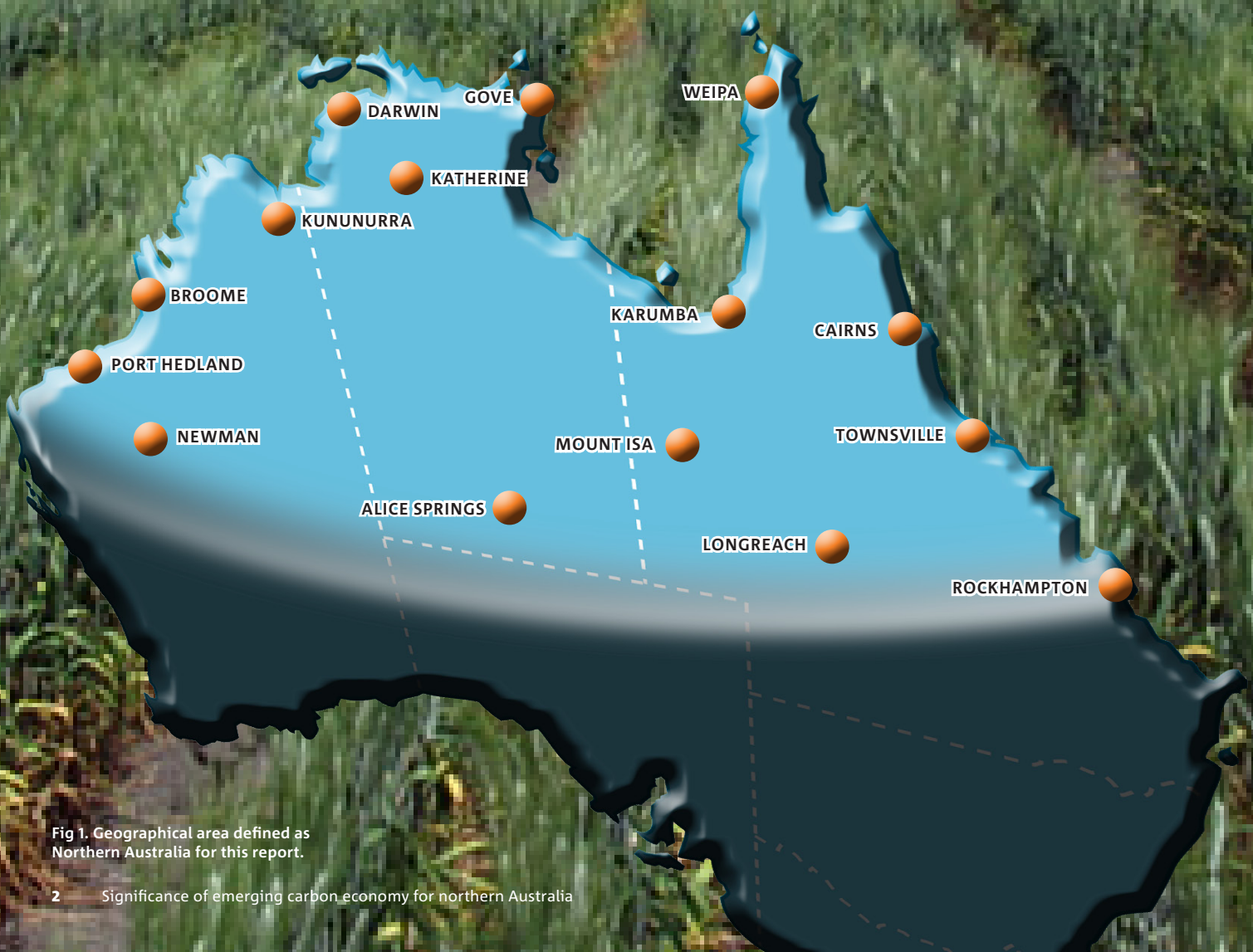
Fig 1. Geographical area defined as Northern Australia for this report.

By Northern Australia we mean lands north of the Tropic of Capricorn, covering close to 300Mha (Fig. 1).