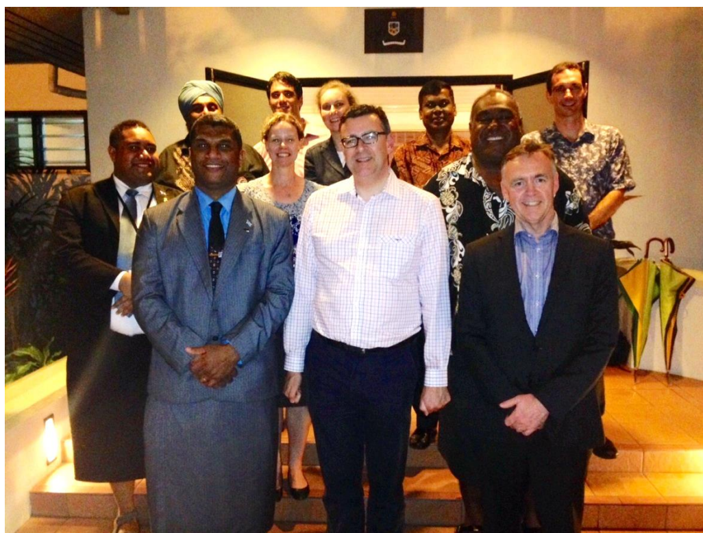
Figure 2 Delegation with Members of the Fiji Public Accounts Committee and representatives of Australian High Commission