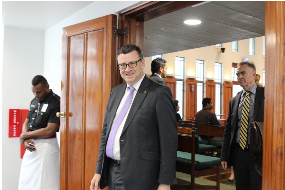
Figure 1 Delegation members, Dr Southcott MP and Senator Ketter, at the Fiji Parliament