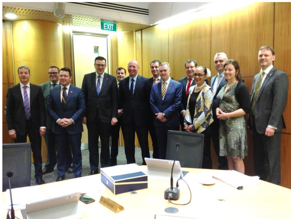
Figure 3 Delegation with Members of the New Zealand Finance and Expenditure Committee