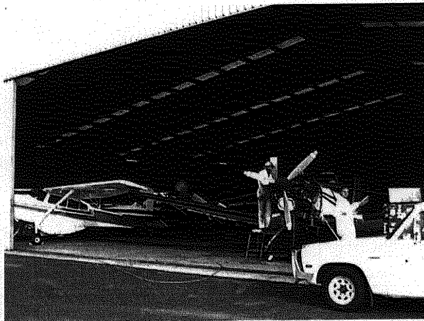
Pays Air Service

Also established is Pays Air Service, involved in general aviation and has been based in Scone for 39 years. There are twelve employees carrying out in house aircraft maintenance and restoration of the company's eleven aircraft, along with aerial agriculture and a fire bombing base.